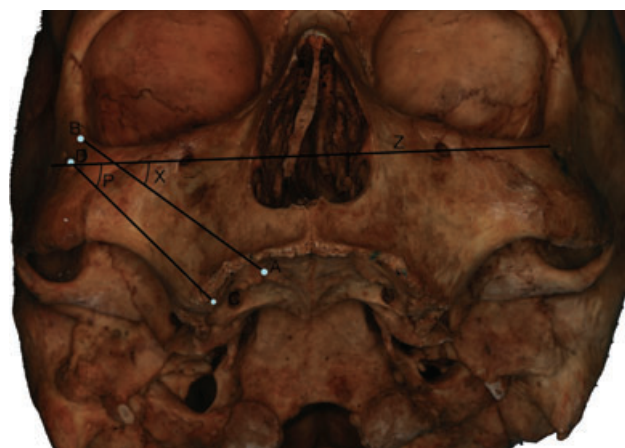
Figure 3 Skull frontal view showing the points A, B, C, and D; the lines AB and CD; and the angles X and P.