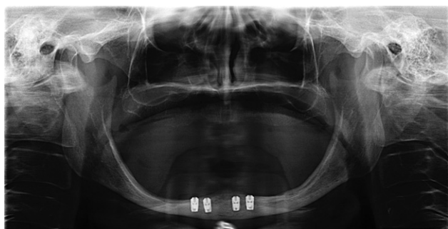
Figure 3 Panoramic radiograph of the same patient as in Figure 1 after insertion of four 6-mm implants in the interforaminal region of the mandible.

Loose and lost implants were scored any time after placement. Standardized panoramic radiographs (Center Apeldoorn: Orthopantomograph OC200D, Instrumentarium Dental, Tuusula, Finland, and Center Ulft: Sirona Orthophos, Sirona Dental Services GmbH, Bensheim, Germany) were taken just after surgery and 12 months after placement of the prosthesis and evaluated at the Medical University Center Groningen (Groningen, the Netherlands). The digital panoramic images were analyzed using a computer software to perform linear measurements on digital radiographs. The known implant length was used as a reference to transform the linear measurements into millimeter. Reference line for bone level evaluation was the outer border of the neck of the implant. Mesial and distal bone changes in this region were considered as peri-implant bone change and were defined as the difference in bone height between the photograph taken after surgery and the photograph taken 12 months after placement of the prosthesis.