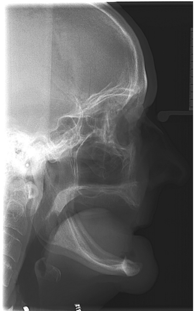
Figure 2 Baseline lateral cephalometric radiograph of the same patient as in Figure 1.

(plaque index, presence of calculus, gingiva index, sulcus bleeding index, and pocket probing depth) were scored 12 months after placement of the prosthesis and differences in patients' satisfaction between before treatment and 12 months after placement of the prosthesis.