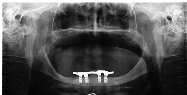
Figure 4 Panoramic radiograph of the same patient as in Figure 1 with bar-supported overdenture 1 year in function.

For presence of plaque, the index according to Mombelli et al. 25 was used (score 0: no detection of plaque;