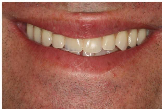
Figure 8 Patient smiling with a complete edentulous maxillary rehabilitation using NobelSpeedy implants with 20 to 25 mm of length after 1 year of follow-up.

Considering patient preferences, a metal-ceramic implant-supported fixed prosthesis with a titanium framework scanned and read by the Procera software (Nobel Biocare AB), with the data digitally transferred to a milling machine for fabrication of the framework, and all-ceramic crowns (NobelProcera titanium framework, Zirconia crowns, Nobel Rondo ceramics, Nobel Biocare AB), and acrylic resin replicating gingival tissues (PalaXpress Ultra); 28 or a metal-acrylic resin implant supported fixed prosthesis with a titanium framework (NobelProcera titanium framework) and acrylic resin prosthetic teeth (Heraeus Kulzer) was used to replace the