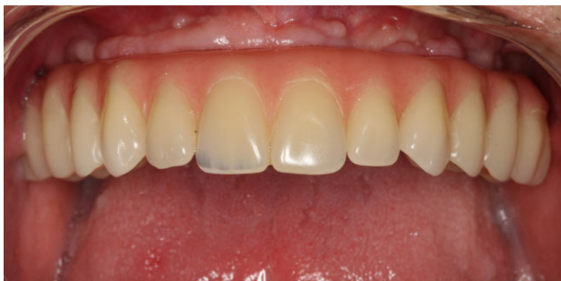
Figure 6 Intraoral photograph of a complete edentulous maxillary rehabilitation using NobelSpeedy implants with 20 to 25 mm of length after 1 year of follow-up.

chin and nose tip using a surgical marker. The distance between these marks represented the reference that allowed for maintaining or increasing the occlusion vertical dimension when the immediate bridge was placed. Full arch acrylic resin (Heraeus Kulzer, Hanau, Germany) prostheses were inserted on the day of surgery ( n = 16 ). The fabrication of the implant supported prosthesis followed standard procedures. 22 After suturing, an impression with putty material (Elite HD+ Putty Soft Fast; Zhermack, Badia Polesine, Italy) was made in a custom open tray. After tray removal, healing caps (Nobel Biocare AB) were placed to support the peri-implant mucosa during the fabrication of the prosthesis. High-density acrylic resin (PalaXpress Ultra; Heraeus Kulzer) prosthesis with titanium cylinders (Temporary coping Multi-unit, Nobel Biocare AB) was manufactured at the dental laboratory, and inserted on the same day usually 2 to 3 hours post-surgically. Anterior occlusal contacts from canine to canine and canine guidance during lateral movements were preferred in the provisional prosthesis. Protrusion incisal guidance