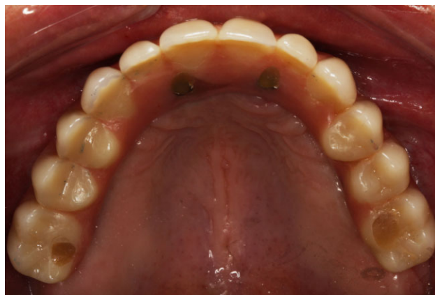
Figure 7 Intraoral photograph (occlusal view) of a complete edentulous maxillary rehabilitation using NobelSpeedy implants with 20 to 25 mm of length after 1 year of follow-up.

was also preferred and no cantilevers were used during the osseointegration period.