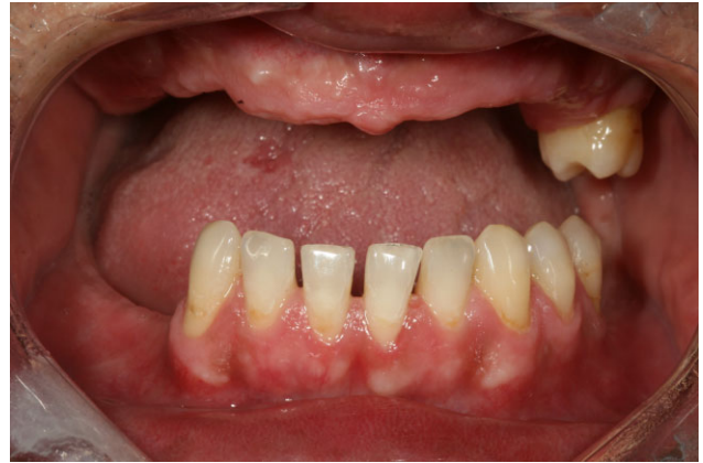
Figure 3 Preoperative Intraoral photograph of a complete edentulous maxillary rehabilitation using NobelSpeedy implants with 20 to 25 mm of length.

which normally reached the canine area. The anterior implants (nonstudy) diameter was 3.3 mm ( n = 2 ), 4 mm ( n = 30 ), or 5 mm ( n = 2 ); while the tilted implants (nonstudy) were 4 mm diameter ( n = 9 ). All conventional nonstudy implants were NobelSpeedy Groovy. A clinical situation is described in Figures 2–8. On partial rehabilitations, the anterior implants were typically placed in the canine or first premolar positions. This implant arrangement resulted in support at both ends of the fixed partial denture, avoiding cantilevers. After closing and suturing the flap with 4-0 and 3-0 non-resorbable sutures (Braun Silkam non-absorbable 4-0, Aesculap, Tuttlingen, Germany), the abutments were accessed by means of a punch if needed and impression copings were placed.