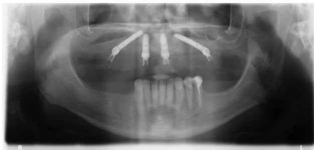
Figure 5 Orthopantomography of a complete edentulous maxillary rehabilitation using NobelSpeedy implants with 20 to 25 mm of length (implants on positions #16 and #26) after 1 year of follow-up.

chin and nose tip using a surgical marker. The distance between these marks represented the reference that allowed for maintaining or increasing the occlusion vertical dimension when the immediate bridge was placed. Full arch acrylic resin (Heraeus Kulzer, Hanau, Germany) prostheses were inserted on the day of surgery ( n = 16 ). The fabrication of the implant supported prosthesis followed standard procedures. 22 After suturing, an impression with putty material (Elite HD+ Putty Soft Fast; Zhermack, Badia Polesine, Italy) was made in a custom open tray. After tray removal, healing caps (Nobel Biocare AB) were placed to support the peri-implant mucosa during the fabrication of the prosthesis. High-density acrylic resin (PalaXpress Ultra; Heraeus Kulzer) prosthesis with titanium cylinders (Temporary coping Multi-unit, Nobel Biocare AB) was manufactured at the dental laboratory, and inserted on the same day usually 2 to 3 hours post-surgically. Anterior occlusal contacts from canine to canine and canine guidance during lateral movements were preferred in the provisional prosthesis. Protrusion incisal guidance