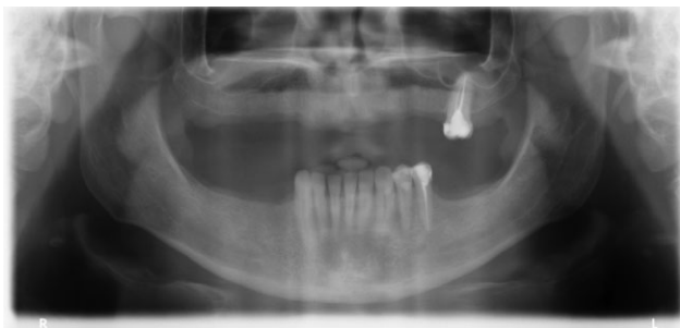
Figure 2 Preoperative orthopantomography of a complete edentulous maxillary rehabilitation using NobelSpeedy implants with 20 to 25 mm of length.

The axial implants were oriented vertically by a guide pin, and care was taken in the selection of the anterior implant length and positions to not come in conflict with the apex of the tilted posterior implants,