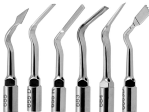
Figure 1 Vibrating tips to cut the periodontal ligament (PDL) fibers. From left to right: arrow-like tip, syndesmotome with teeth perpendicular and parallel to the handpiece long axis, left- and right-angled 45° syndesmotome without teeth, right-angled 45°, large syndesmotome with teeth.

Six different tips (Figure 1) were available to adapt to the various clinical situations. The first one is arrow like and sharp on both sides (Figure 1); it was used to penetrate into the periodontal ligament (PDL) at the coronal part and start sectioning the fibers of the PDL. To deeper section the PDL fibers in the apical direction, four