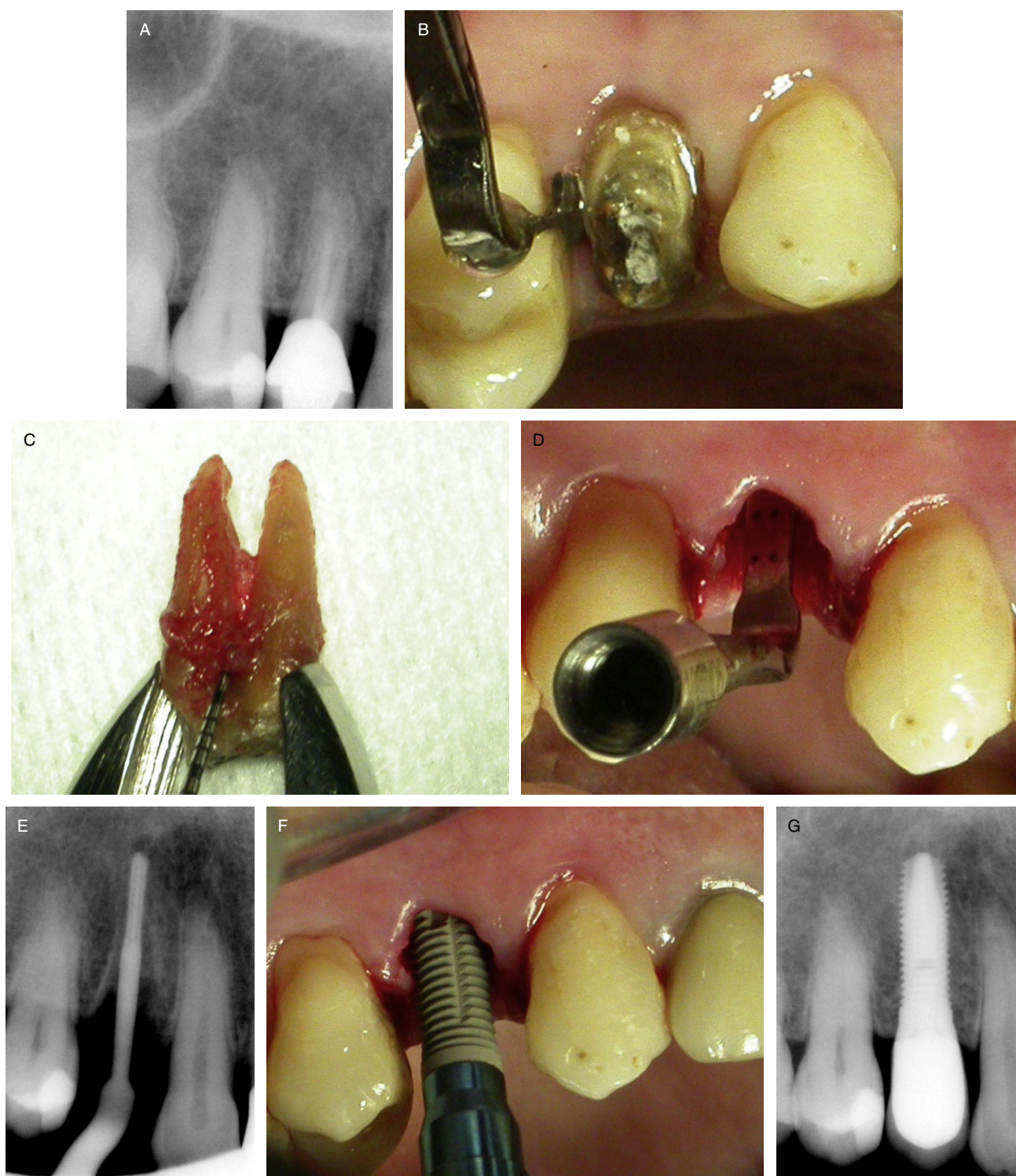
Figure 5 Treatment of a chronically infected site with an immediate implant. A , Radiograph of the infected tooth to be extracted. B , Cutting the periodontal ligament (PDL) fibers with the arrow-like tip on the distal side of the tooth. C , Chronically infected tooth after extraction. D , Vibrating tip placed in the osteotomy showing direction of the implant to be placed. E , Radiograph of the vibrating tip during preparation of the osteotomy. F , Immediate implant placed. G , Radiograph at the 2-year control.