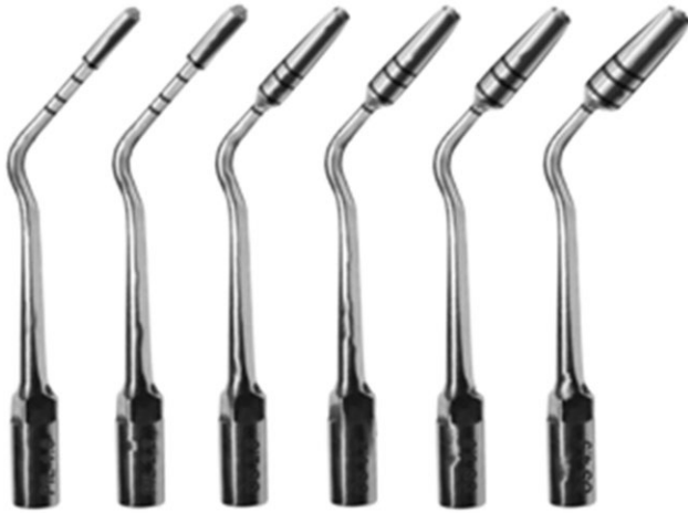
Figure 2 Vibrating osteotomy tips for extraction sockets. From left to right: two cylindrical pilot tips, conical tips of increasing diameter.

syndesmotomes were further used; two of them are straight with teeth; their cutting direction is parallel and perpendicular to the long axis of the tip (Figure 1). The two other items are 45° angled, one to the right and one to the left (Figure 1), in order to better adapt to the socket geometry. The last one, with teeth, was indicated to extract ankylosed teeth (Figure 1).