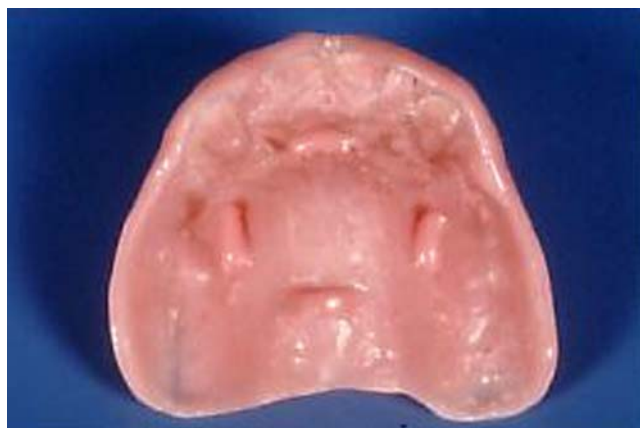
Fig. 3 Adhesive applied in maxillary denture, four strips of 1 cm at frontal, dorsal, right, and left border of hard palate