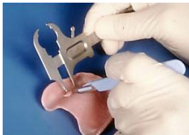
Fig. 4 Strips of adhesive measured with Boley gauge and cut off with sharp instrument

were analyzed by two-way ANOVA, and 95% confidence intervals were calculated.