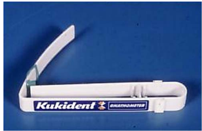
Fig. 1 Disposable gnathometer

The main part of this study was conducted for determining objectively the effect of a denture adhesive on the retention