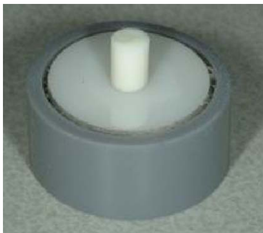
Fig. 1 The Y-TZP disc specimen was embedded in the PMMA with the cementation surface exposed. Cement was applied incrementally, not exceeding 2 mm, to the surface using polyethylene molds (inner diameter=3.6 mm, height=5 mm) and polymerized accordingly

The discs were randomly divided into eight groups depending on the cement type and the ageing condition to be applied ( N=80 , n=10 /per group; Table 1). Four types of resin materials were chosen: a light-polymerized (Panavia F 2.0, Kuraray, Medical Inc., Osaka, Japan), self-adhering (Multilink Ivoclar Vivadent, Schaan, Liechtenstein) and chemically polymerized cement (SuperBond, Sun Medical, LTD, Tokyo, Japan) where the resin composite (Quadrant Posterior Dense, Cavex, Harlem, The Netherlands) acted as the control material.