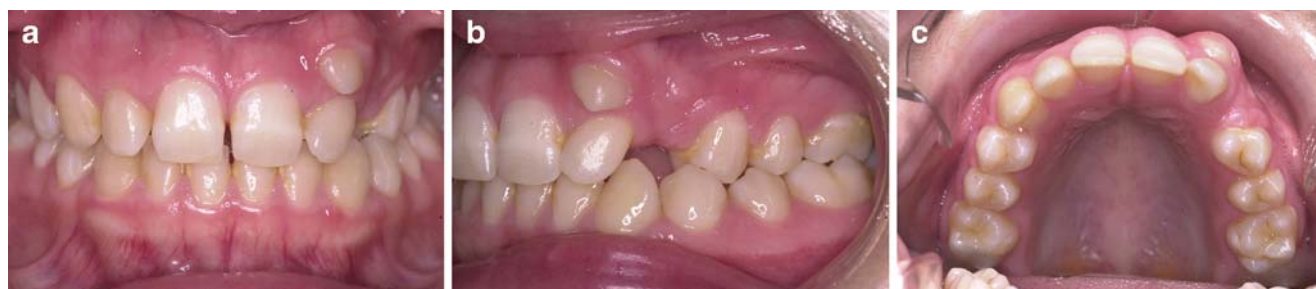
Fig. 1 Clinical intraoral photographs of a 20-year-old female patient showing an impacted upper left canine: a frontal view, b sagittal view, c occlusal view