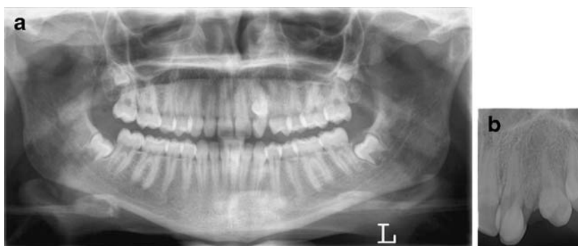
Fig. 2 A series of 2D images taken as a routine procedure for orthodontic treatment reveals an impacted upper left canine with no sign of resorption in lateral incisor tooth #22. a Panoramic image confirming the impacted canine position, b Intraoral periapical film showing the relative position of the impacted canine with intact root contour and no resorption is visible in tooth #22

diagnostic accuracy of panoramic radiograph. In addition, using panoramic radiography for the detection of root resorption has a restricted diagnostic value because the accuracy of assessing palatal or buccal root resorption of the lateral incisor is limited, particularly in early or mild resorption cases [18, 22, 24, 42]. Furthermore, conventional radiological imaging techniques, such as panoramic imaging, have been found inadequate for the diagnosis of root resorption in the maxillary incisors with impacted canines [23] (Figs. 1, 2).