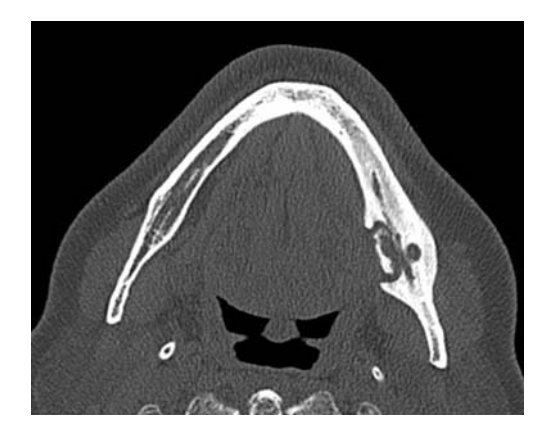
Fig. 2 Bisphosphonate-related osteonecrosis of the mandible. The patient (no. 13) underwent dental surgery at the same site 20 months before the onset of the lesion. The lesion caused massive buccal and lingual damage to the cortex of the mandible (only lingual penetration is seen here). Note the continuity of the cortex of the mandibular canal

The present bicenter study describes the CT presentation of BRONJ and correlates it with selected clinical features of 30 patients with BRONJ. The CT findings matched the clinical diagnosis of BRONJ in 26 individuals (an approximate 78% detection level per lesion and 86% detection level per patient). Furthermore, the CT scan demonstrated