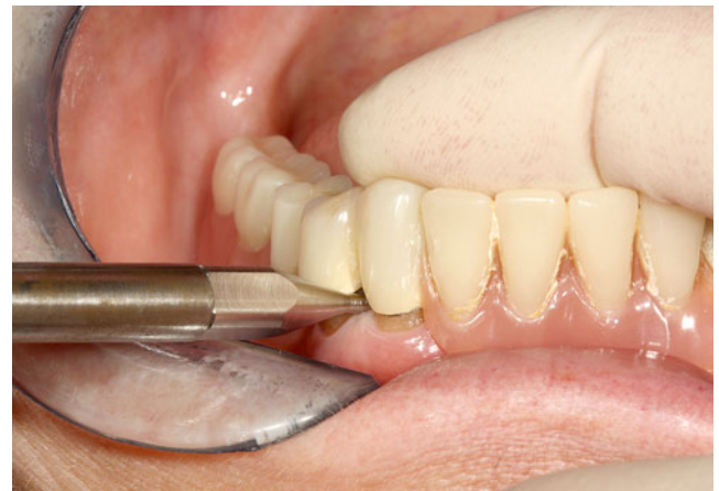
Fig. 1 In vivo measurement. Intraoral retention force measurement at a denture of the lower jaw. Double crowns are found at the left canine and first premolar. The denture is secured by the examiner not to fall off suddenly

Seventy-two measuring points were used for the retention force measurements of the inserted dentures. Their position