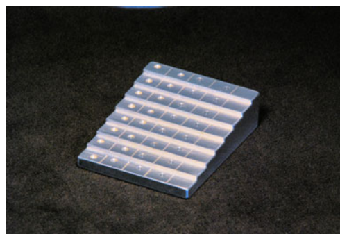
Fig. 1 Aluminum step wedge with boreholes

A direct digital cephalometric unit (Orthophos DS Ceph, Sirona Dental System GmbH, Bensheim, Germany) equipped with a CCD sensor with an effective detector array of 138.6 \times 5.9 \text{ mm}^2 was used for image acquisition, providing a spatial resolution of 282 \times 282 \text{ dpi} . The wedge phantom was