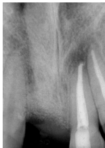
Fig. 8. Follow-up radiograph taken 18 months following decoronation.

At the age of 17.5 years, about two and a half years after decoronation and before his admission to