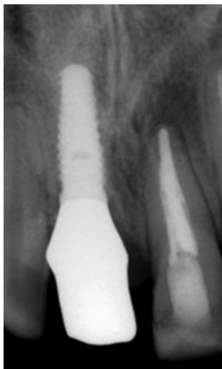
Fig. 13. Radiograph of the implant and final restoration.