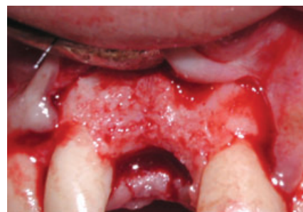
Fig. 10. Clinical view of alveolar ridge prior to implant insertion to replace the maxillary right central incisor.