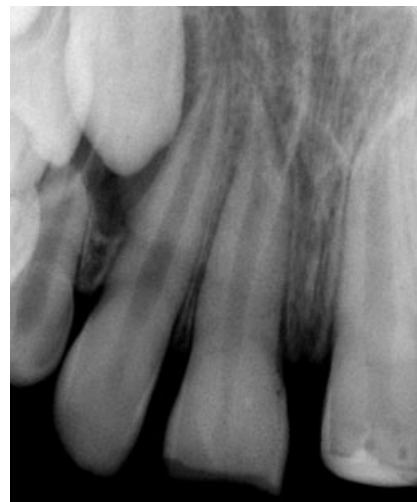
Fig. 1. Periapical radiograph of maxillary right central incisor immediately after replantation.

A 15-year-old boy presented to the pediatric dental clinic at the School of Dental Medicine, Hebrew University with a complaint of a non-esthetic maxillary right central incisor position. His medical history included the presence of an allergy to penicillin and a heart murmur with regurgitation that required antibiotic prophylaxis prior to dental intervention. Dental history revealed that at the age of nine, during gymnastic training at school, he fell and both maxillary central incisors were traumatized. Based on the patient's records, the injury caused the avulsion of his maxillary right central incisor combined with an uncomplicated crown fracture and sub-luxation of the maxillary left central incisor accompanied by a complicated crown fracture. The avulsed tooth was left in dry extraoral conditions for 90 min prior to being treated by a professional dental provider. The emergency treatment included rinsing the root and socket of the maxillary right central incisor with saline solution prior to replantation (Fig. 1). The