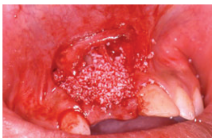
Fig. 6. Bone graft (Bio-Oss) applied on top of decoronated root to augment alveolar bone deficiency.

the army, a metacarpal analysis was performed to assure completion of developmental growth prior to implant insertion. A CT scan of the edentulous site indicated the feasibility for placing a dental implant (Fig. 9).