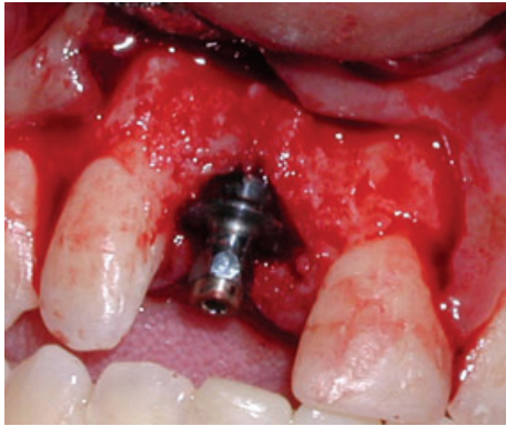
Fig. 11. Implant placement.

A 15-mm long, 5-mm wide tapered screw type implant (3i, Osseotite NT; Implant Innovations Inc., Palm Beach Gardens, FL, USA) was placed using a two-stage surgical protocol (Figs 10 and 11). Six months later, the final crown was fabricated (Figs 12 and 13).