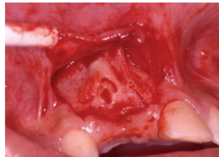
Fig. 5. Decoronated root canal filled with blood.