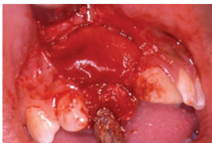
Fig. 7. Collagen membrane (Bio-Gide) covering Bio-Oss particles.