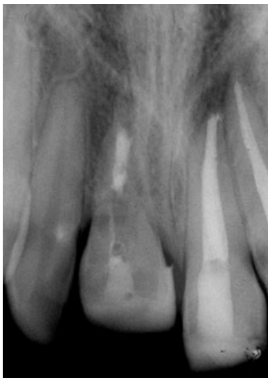
Fig. 3. Radiograph of ankylosed maxillary right central incisor.

process of healing without evidence of root resorption. The adjacent teeth were asymptomatic and responded normally to thermal and electric pulp stimuli. A diagnosis of replacement root resorption of the maxillary right central incisor was made and the patient was referred to a multidisciplinary team of specialists for evaluation and treatment planning.