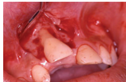
Fig. 4. Full thickness mucoperiosteal flap elevation exposing the ankylosed tooth.

The surgical procedure was performed after obtaining parental consent. The patient was given antibiotic prophylaxis (600 mg clindamycin, Dalacin C; Upjohn, Puurs, Belgium) 1 h prior to treatment. Following administration of local anesthesia, an intrasulcular incision around the treated tooth with mesial and distal sub-marginal releasing incisions was performed to avoid the interproximal papillae. A full-thickness buccal mucoperiosteal flap was elevated exposing the tooth and the labial cortical plate (Fig. 4). The palatal tissue was left intact. The crown was decoronated and the root canal filling removed. The root canal was then alternately instrumented and rinsed with saline until bleeding from the surrounding tissues filled the empty root canal (Fig. 5). This step is critical, as the blood clot will decrease the risk of infection and allow the ingress of osteoclasts and osteoblasts, thus