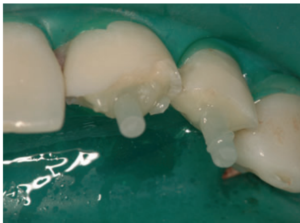
Fig. 3. FRC Postec cemented in root canal with composite cement.

After post fixation, crown reconstruction was performed with the Finger Tip Technique by using composite resin materials. Hard dental tissues of the tooth crown were treated mechanically and chemically. Mechanical treatment consisted of burr beveling of the enamel to increase the bonding surface as well as to achieve gradual transfer of the composite resin to the tooth surfaces and easier adjustment of the color. The color of the tooth crown depends on internal as well as on external crown structure. It is very complex and never consists of a single shade. Therefore, because of the complexity of the dental tissue it is impossible to perform the reconstruction in only one color shade of the