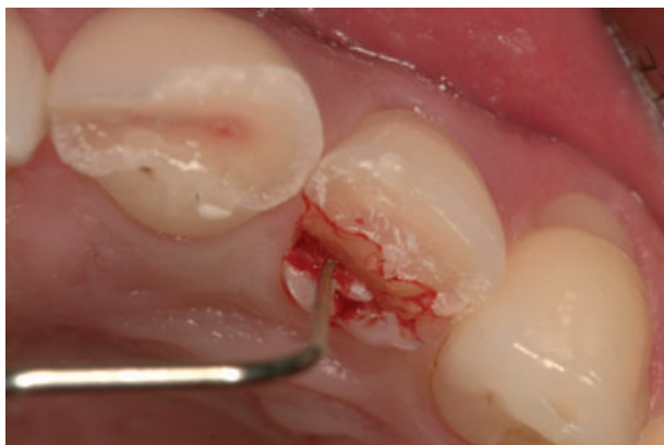
Fig. 1. Horizontal fracture of upper incisors and vertical fracture of the palatal enamel of the second lateral upper incisor.