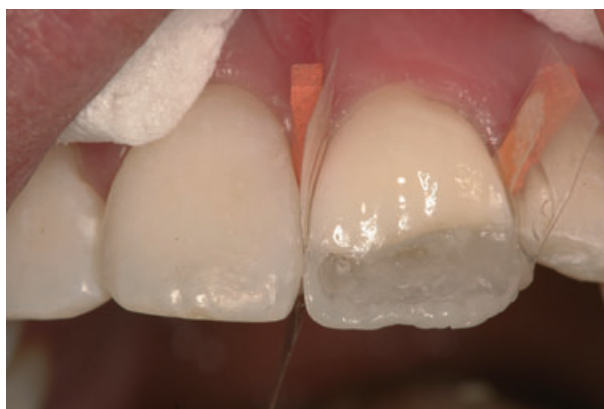
Fig. 4. Palatal wall reconstructed with enamel shade.