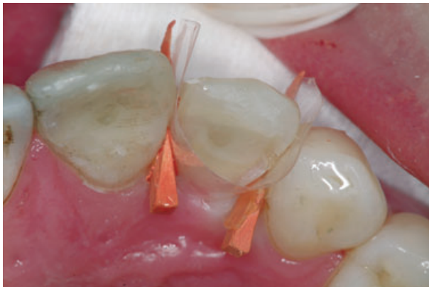
Fig. 7. Shaping of the palatal surface on the upper lateral incisor.