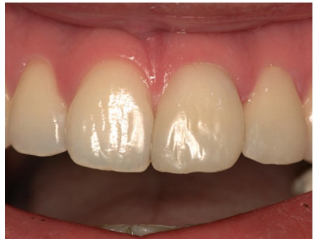
Fig. 9. Reconstructed upper incisors.

patient request for immediate sanitation and his inability to finance prosthetic therapy. During the reconstruction of the fractured crown, it is important to consider possible mistakes. Complete removal of the gutta-percha from the dentinal walls is necessary when preparing the root canal for adhesive cementation of the prefabricated composite post because the remaining gutta-percha and paste interfere with hybridization of the root dentin. The posts must not fit too tightly to the root canal walls or additional tension will be created during polymerization (8). In order to achieve good retention the posts should be inserted at two-thirds of the canal length (9). To decrease the porosity caused by air bubbles that remain in the root canal upon cement insertion, the use of a lentulo spiral is recommended.