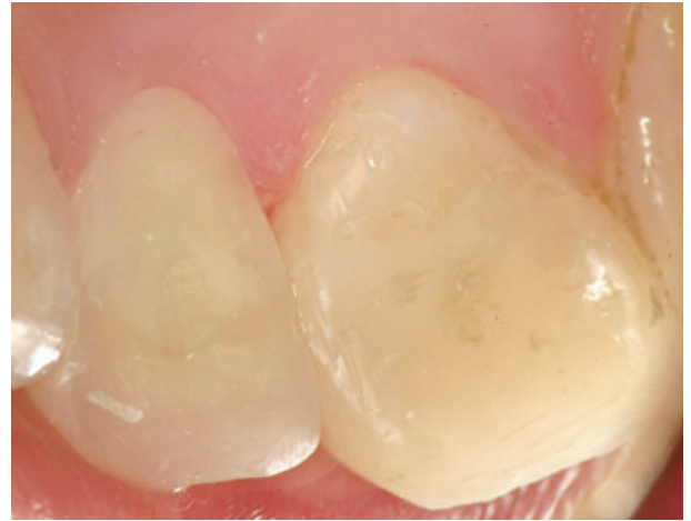
Fig. 8. Palatal surfaces of reconstructed upper incisors.