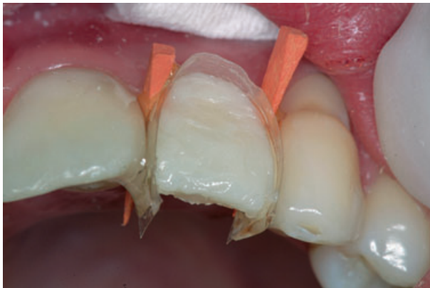
Fig. 6. Shaping of the vestibular surface on the upper lateral incisor.

The reasons for choosing an immediate, single visit reconstruction of the upper incisor trauma with composite materials instead of prosthetic therapy are: age of the patient, preserving the remaining hard dental tissue,