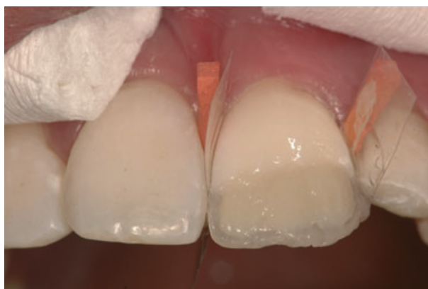
Fig. 5. Reconstruction of the fractured crown with dentin shades.

composite resin. The central incisor was reconstructed first. A layer of enamel shade of the composite resin was placed at the palatal shell (Fig. 4), slightly under the desired length, around 1 mm thick. As the color of dentin determines the color of the tooth, it is important that the palatal wall is not too thick so as to leave enough room for dentin composite material (Fig. 5) and in the