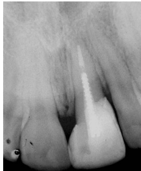
Fig. 9. Radiographic aspect after 24 months of follow up.

right central incisor and maxillary left lateral incisor, at the incisal third, to provide the necessary anchorage for tooth movement (Fig. 7). A 0.012-inch stainless steel wire (Dental Morelli) was bent to form a 2-mm diameter loop with a 4-mm radicular extension, which was further roughened with diamond disks to provide retention and was cemented with glass ionomer cement (Vidrion R, SS White) in the coronal root canal third of the fractured tooth. Next, a 1/8 diameter orthodontic elastic was placed through the coronal loop and tied to the palatal bow fixed between the neighbouring teeth. The elastic string was changed once a week. Orthodontic extrusion was terminated when all root margins were exposed, which was achieved within 21 days. After reestablishment of the biological width, the tooth was splinted with composite resin (TPH, Dentsply) for 12 weeks and a mucoperiosteal flap repositioning surgery was performed in the area surrounding the extruded tooth. The treatment was completed with post space preparation and cementation of a metallic radicular post (FKG Dentaire, La-Cheaux-de Fonds, Switzerland) to provide resistance to the fractured tooth. The palatal access was