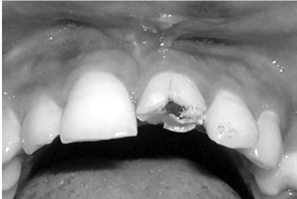
Fig. 1. Pre-operative clinical view.