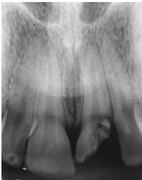
Fig. 3. Pre-operative periapical radiograph.

treated conservatively with local antiseptic solution, the coronal pulp was curetted, and the pulp chamber received a dressing with a commercially prepared antibiotic-corticosteroid product (Otosporin ® , Farmoquímica S/A, Rio de Janeiro, RJ, Brazil) and was provisionally sealed with a glass ionomer cement (Vidrion R, SS White, Rio de Janeiro, RJ, Brazil). Antibiotic therapy (amoxicillin 500 mg, three times/day; Eurofarma, São Paulo, SP, Brazil) was started and maintained for 7 days. An anti-inflammatory (Potassium diclofenac 50 mg every 8 h for 3 days; Novartis Biociências SA, São Paulo, SP, Brazil) and an analgesic (Paracetamol 750 mg every 6 h in case of pain; Aventis Pharma Ltd, Suzano, SP, Brazil) were also prescribed.