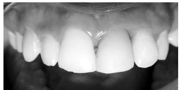
Fig. 5. Clinical aspect after adhesive coronal fragment reattachment.