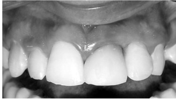
Fig. 8. Clinical view after 24 months of follow up.

Orthodontic extrusion was performed using a fixed appliance to re-establish the biological width. A 0.028-inch round stainless steel orthodontic wire (Dental Morelli, Sorocaba, SP, Brazil) was fixed with light-cured composite resin to the palatal surface of the maxillary