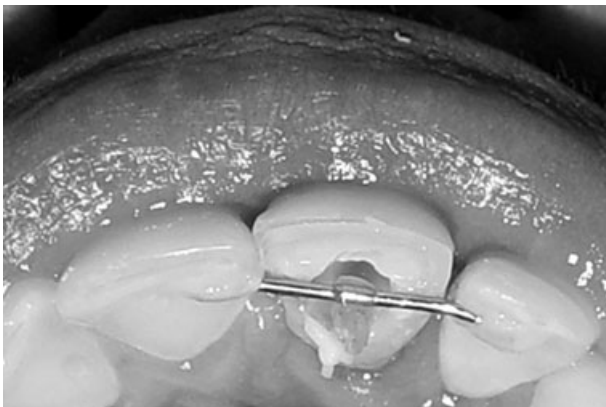
Fig. 7. Fixed appliance used for orthodontic extrusion installed and activated.

distal aspect of the apical fragment was not possible due to the invasion of the biological width (Fig. 6). Endodontic therapy started with removal of pulp tissue from the remaining root portion under copious 1% sodium hypochlorite irrigation (Milton solution, Asfer-Industria Quimica Ltda, São Caetano do Sul, SP, Brazil), instrumentation and placement of a calcium hydroxide-based intracanal dressing for 30 days. Definitive root canal obturation was performed thereafter with lateral condensation of gutta-percha points (Tanari; Tanariman Industrial Ltda., Manacapuru, AM, Brazil) and Sealapex root canal sealer (Kerr Corp., Orange, CA, USA), leaving the coronal third unfilled.