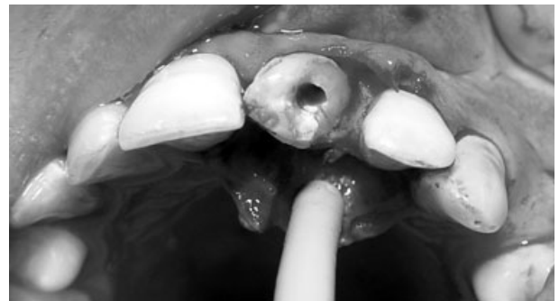
Fig. 4. Clinical aspect during the exploratory surgery showing the extension of the complicated crown-root fracture, invading the biological width in the distal aspect.

Two days after the emergency visit, an exploratory surgery showed that the fracture complicated crown-root extended deeply subgingivally, invading the biological width in the distal aspect and reaching 2 mm below the bone crest (Fig. 4). In the same session, the coronal fragment maintained in saline storage was reattached to the root remnant using an adhesive restorative technique with a total-etch adhesive system (Single Bond; 3M/ESPE, St Paul, MN, USA) and a light-cured microhybrid composite resin (TPH, Dentsply Ind. e Com. Ltda, Petrópolis, RJ, Brazil). The restoration of the fractured crown was completed with composite resin (Fig. 5). Due to the loss of tooth structure, a bevel was made on the remaining root portion to increase fragment retention. An adequate adaptation of the incisal fragment to the