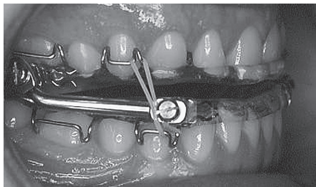
Figure 1 Removable Herbst mandibular advancement splint, with full occlusal coverage and short intermaxillary elastics to limit mouth opening during sleep.

Data were not normally distributed and therefore non-parametric tests were applied. The median described the measure of central tendency whilst comparisons before and with treatment were made using the Wilcoxon matched-pairs signed-ranks test. Cohen's kappa ( \kappa ) statistic was used to test the repeatability of the SNE.