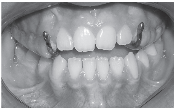
Figure 1 Intraoral view of the appliance.

Lateral cephalometric films, in natural head posture, were taken at the start and end of protraction. All the radiographs were taken with Trophy Ortho Slice 1000 C (Asahi Roentgen Ind. Co. Ltd, Kyoto, Japan) and were scanned at 300 dpi with an Epson Expression 1680 Pro scanner (Seiko Epson Corp., Nagano-Ken, Japan) into Dolphin Imaging Software 9.0 (Los Angeles, California, USA). The skeletal and dental parameters were calculated using the Dolphin Imaging software program, whereas head posture and sagittal airway measurements were traced, measured and registered by hand using conventional methods. The skeletal changes were assessed by SN–GoMe angle, ANSMe/NMe ratio, NP–A distance, maxillary depth angle, maxillary height angle, SNA angle, SNB angle and ANB angle. The dental changes were evaluated by U1–SN angle, L1–MP angle, SN–PP angle and SN–OP angle. The other parameters related to head posture and sagittal pharyngeal airway were NSL–OPT, NSL–CVT, NL–OPT, NL–CVT, and OPT–CVT