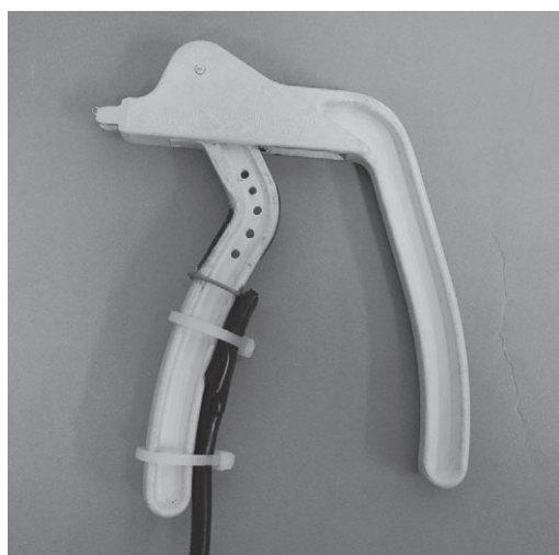
Figure 1 Polypropylene pliers with the five holes in the top one-third of the active arm lateral surface; strain gauges are bonded to the anterior and posterior active arm face of the pliers.

The crowns of 75 permanent bovine incisor teeth were sectioned at the superior and inferior thirds, to obtain 10 mm high coronary portions. The coronal portions were placed with the vestibular face against adhesive tape fixed