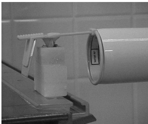
Figure 1 Radiographic technique without inclination of the tooth, in the bucco-lingual direction (0 degree).

To reproduce the focus-object-film relationship for all periapical radiographs of the same tooth, occlusal registration