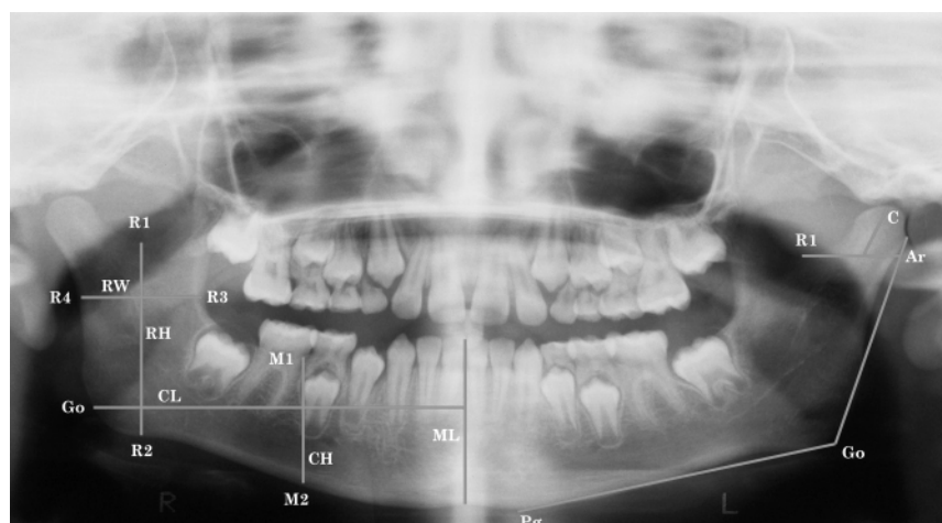
Figure 1 Panoramic radiograph showing the landmark points and linear and angular measurements used in this study. (R1–R4) Points described by Ricketts (1961) at the mandibular ramus: Go, gonion; M1, point at the cervical point of the first permanent molar; M2, corresponding perpendicular point to M1 at the inferior border of the mandible; Pg, pogonion; Ar, articular; C, condylion; RW, ramus width; RH, ramus height; CL, corpus length; CH, corpus height; ML, midline.

Corpus height (CH): perpendicular distance between the lowest mesial point of the permanent first lower molar at