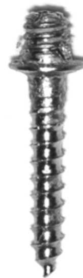
Figure 1 Screw-shaped titanium orthodontic miniscrews with a length of 8 mm and a diameter of 1.4 mm (Dual Tops; Jeil Medical Corporation).

A total of fifteen, 8-month-old New Zealand white adult male rabbits weighing 3000–3500 g were used for the study.