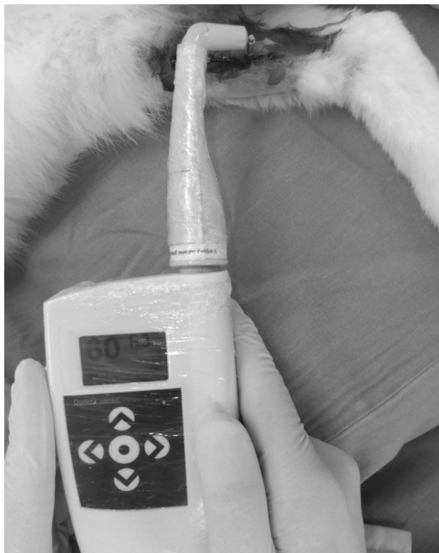
Figure 3 Orthodontic miniscrew stability was monitored using resonance frequency analysis (Ostell; Integration Diagnostics AB) device.

corresponding implants were inserted by prefabricated distance holders in a standard distance of 15 mm.