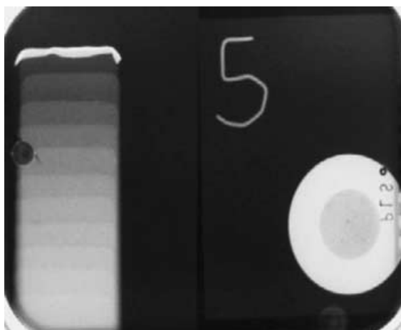
Figure 2 Unretouched radiograph in greyscale reproduction, as scanned. The material is Ketac Silver – 10.5 mm Al. Although the picture appears less clear than the pseudo-colour rendition, it is more precise and contains more detail.

added as a control, although it is sometimes considered a bona fide root-end filling material (Marcotte et al. 1975). The manufacturers of the test specimens are listed alongside the product in Table 1. The lot or batch number, whenever indicated on the package, is available through the authors. The materials that were tested belong to various groups: temporary or intermediate filling materials, such as Cavit or IRM; Altect, a hard-setting aluminate