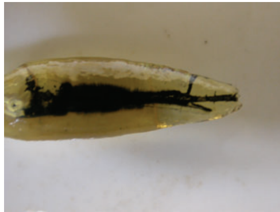
Figure 3 A lateral canal in the apical third of the root.

Table 2 shows the number and percentage of lateral canals and intercanal communications as well as position of lateral canals. Lateral canals were present in only 6.2% of roots. There was an increasing prevalence of lateral canals towards the apical third of the root with approximately 64% occurring in the apical part of the roots. A lateral canal in the apical third of the root is clearly shown in Fig. 3. Intercanal communications were found in 83 teeth (18.4%).