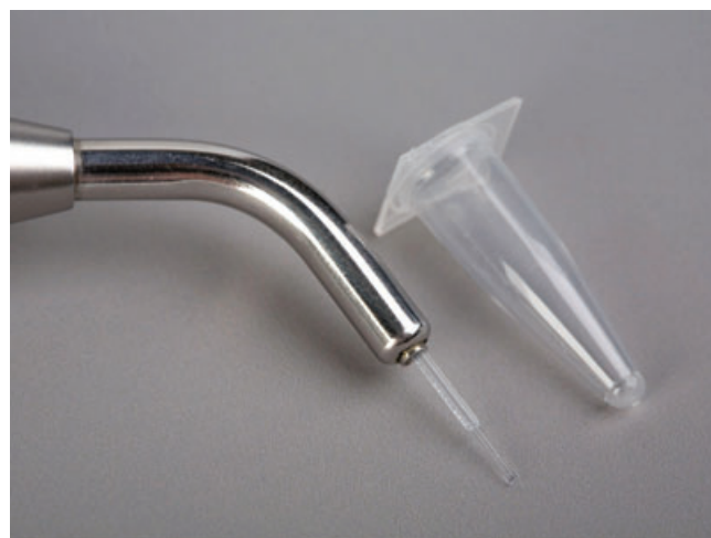
Fig. 1. Laser tip (on the left) was introduced into the Eppendorff tube (on the right) which was followed by microbial plating.

Bacterial strains were sub-cultured on blood agar base for 72 h and suspensions were prepared in phosphate-buffered saline of approximately 10 5 colony forming units per ml. The test volume was 40 \mu l in an Eppendorff PCR-vial. Before starting the experiment, 20 \mu l was extracted and spread on a culture plate for a baseline assessment. Measurements were performed in triplicate for each single microorganism and exposure time. Before use, the laser was activated on a piece of carbon paper. Bacterial suspensions were prepared to be exposed to a Nd:YAG laser for four different periods of time: