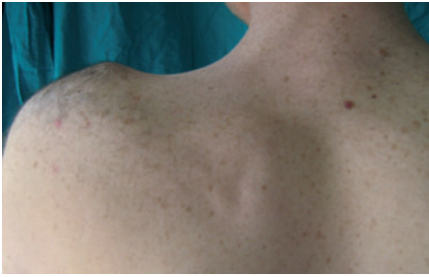
Fig. 2. Reticulate pigmentation of the skin was on the front of his neck and shoulders.