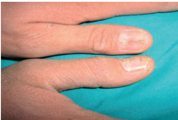
Fig. 3. Nail dystrophy in hand.

tosis and chronic inflammation. Pigmentary incontinence was also seen, all being features of leukoplakia.