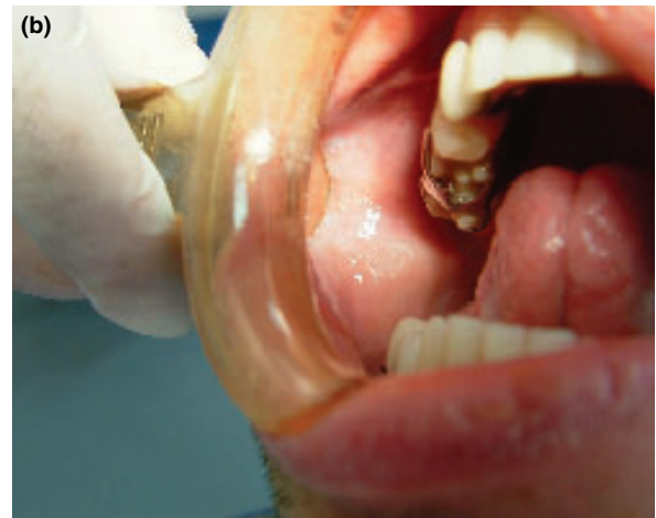
Fig. 4. Oral hygiene instructions were given to the patient and the patient was rehabilitated with fixed and removable partial denture (a). Clinical appearance of the buccal mucosa after therapy (b).

The dental treatment was performed according to plan. The treatment plan included a strict prevention protocol: cleaning; fluoride varnish was applied after restorative treatment, meticulous oral hygiene instructions; restorations of the permanent molars; extraction of primary teeth. The primary teeth were extracted under local anaesthesia. After establishing optimal oral health (e.g. restoration of carious teeth and scaling), oral hygiene instructions were given to the patient and he was rehabilitated with fixed and removable partial denture (Fig. 4a and b).