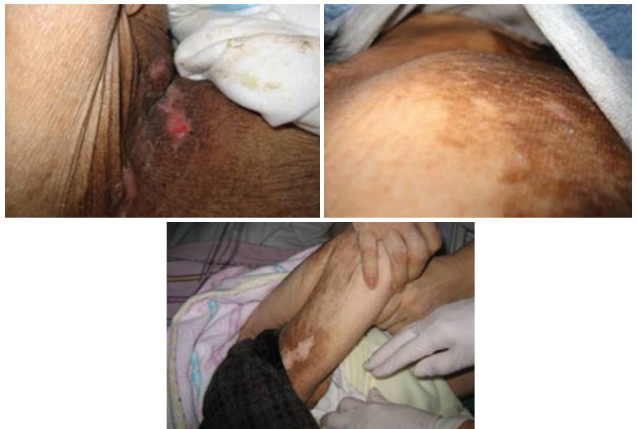
Fig. 3. Ulcers and scars in the patients' skin.

bodies specific in pemphigus or BP using the remaining serum from a routine blood test performed by her physician. Enzyme-linked immunosorbent assays (ELISA) were performed to determine anti-desmoglein 1, anti-desmoglein 3 and anti-BP180 antibody titres in blood (Table 2). Anti-BP180 antibody titre was remarkably elevated. As our hospital did not have a dermatologist (now our hospital has a dermatologist after the experience of this case), we consulted the dermatological authorities of the university hospital regarding the patient's clinical course and features focusing on the oral mucosa and the results of skin and blood tests. BP was very strongly suspected in this case, but unfortunately the patient again suffered aspiration pneumonia just after this consultation. Further examination for BP, for example skin biopsy, was post-poned because of her worsened general condition. Despite rigorous antibiotic treatment, the patient died because of pneumonia under intensive and palliative oral care for the symptoms strongly suspected BP by oral care providers consisted of dental hygienists, nurses in her ward and dentists.