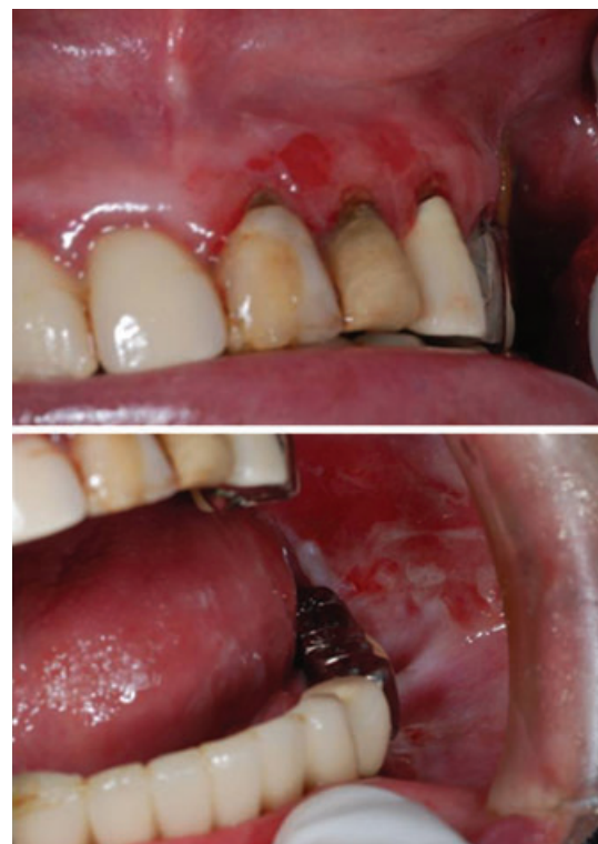
Fig. 2. Observed oral mucosal ulcer. Severe recurrent oral mucosal ulcers were observed despite intensive oral care.

The patient showed severe recurrent oral mucosal ulcers despite daily gentle brushing of the teeth by a dental hygienist, dentist and nurses for 1 week (Fig. 2). The ulcers were