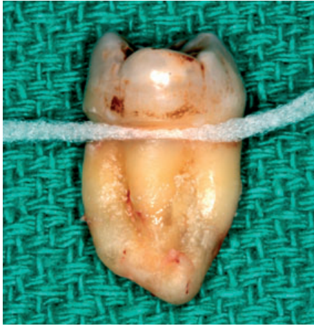
Fig. 4. Extracted tooth no. 16 with floss inserted into the linear notch-like defect demonstrating a tight fit that facilitated the sawing action.

molars were inspected to insure that caries had not involved the linear notch-like defect.