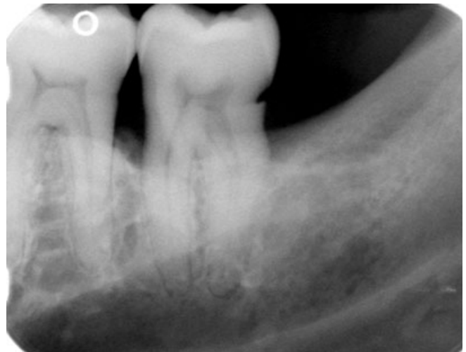
Fig. 2. Radiograph of mandibular left 2nd molar (no. 18) showing 'V'-shaped notch-like defect on distal surface.