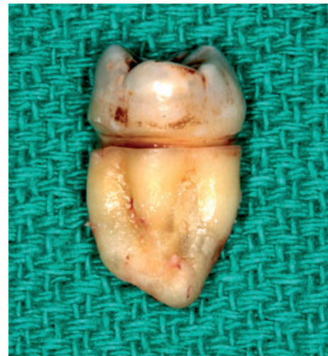
Fig. 3. Extracted tooth no. 1 showing the extensive linear notch-like defect resulting from 'sawing' with dental floss.

with aggressive horizontal toothbrushing. When asked to demonstrate his flossing technique, the patient passed the floss between his molars, slipped it into the distal abrasion defect (Fig. 4) and held the extended threads parallel to one another. Once in place, he flossed using a sawing action. The patient stated that he had used this technique daily for many years.