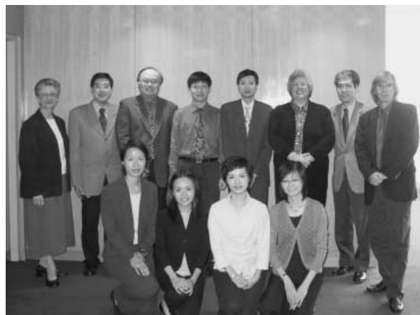
Examiners and candidates for Conjoint Membership in Paediatric Dentistry, Hong Kong, November 2003.