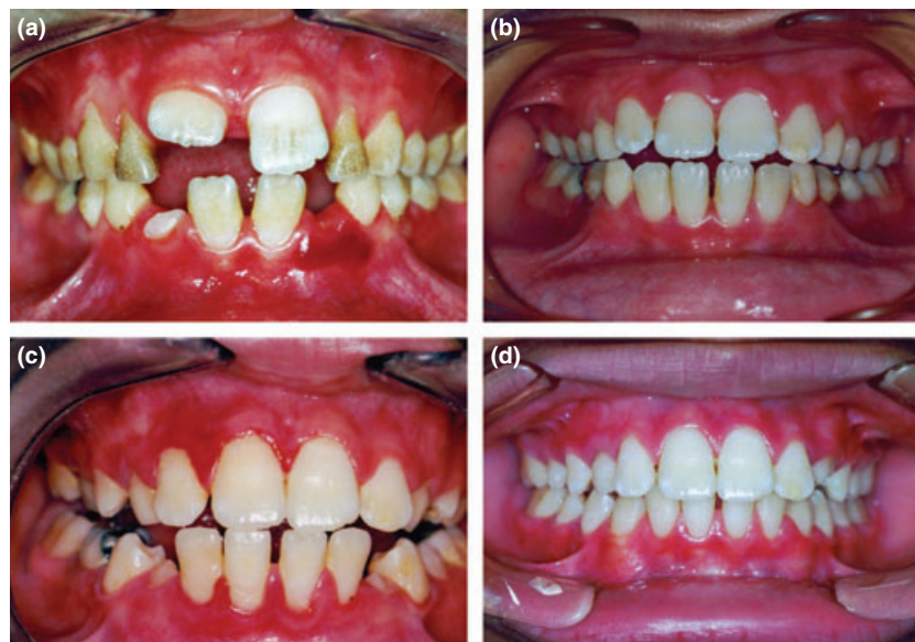
Fig. 2. (a) Seven weeks after starting treatment: the upper gingival mucosa has improved, and bleeding and desquamation present in the lower gingival mucosa. (b) Twelve weeks after starting treatment: signs have disappeared except for the gingival redness. (c) Recurrence of signs about 30 months from starting treatment. (d) Appearance at most recent follow-up, off treatment: gingival mucosa appears normal.

peeling of the gums of the lower jaw only and clinical examination confirmed that there was a greater improvement in the upper gingival mucosa (Fig. 2a). Fluocinonide was continued for upper and lower jaws for another 5 weeks. After that period (12 weeks), the signs and symptoms had resolved except for the redness of the gingiva (Fig. 2b). The patient was reviewed monthly and signs and