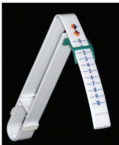
Fig 2 (right) The dynamometer.