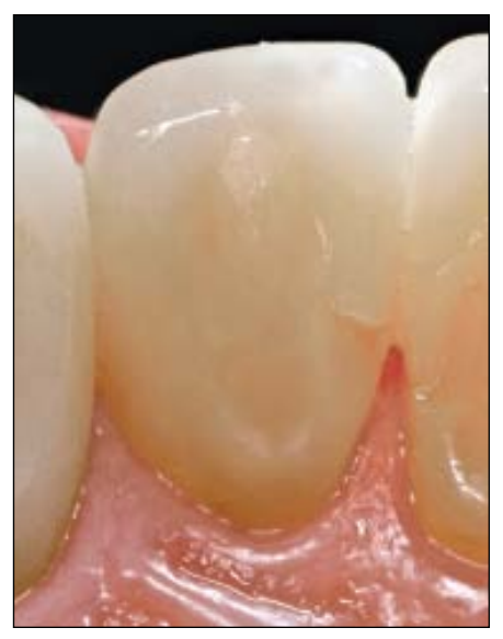
Fig 3 Palatinal fracture of ceramic in a nonvital tooth.

Patients were informed that there was still a risk of ceramic fracture if compliance with using the occlusal guard was inadequate. No guards would have worsened the results, but not all guards were worn, even after careful explanation. But the results of this clinical study suggest that even when patients with parafunction are selected for esthetic veneer restoration, the overall outcome and clinical acceptance are satisfactory. However, before preparation, patients should be informed about the almost 8-times higher risk of failure resulting from bruxism as motivation to wear the