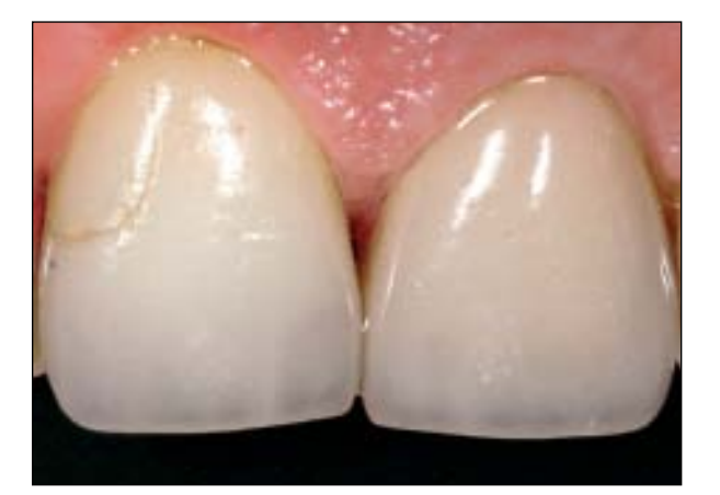
Fig 4 Crack in the ceramic and marginal discoloration resulting from a smoking habit.

the restoration.<sup>28,29</sup> The determined risk was almost 8 times higher for failure in bruxing patients than in patients without a bruxing habit. This is more than 3 times higher than that for all restorations observed in general.<sup>17</sup> Parafunction may continue after careful restoration,<sup>30</sup> even after specific guidelines are established with the patient. Therefore, after placing the ceramic restorations, patients who were bruxers were provided with hard acrylic resin occlusal guards to protect the definitive restorations during bruxing episodes.