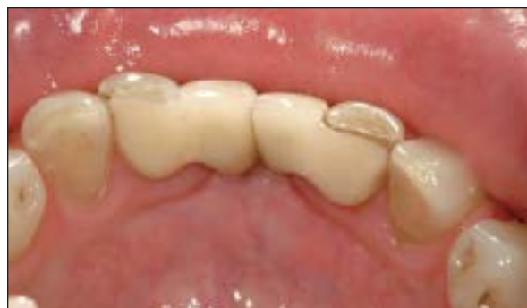
Fig 2 Lingual view of two all-ceramic RBFDPs replacing mandibular left and right central incisors. Distinct marginal discoloration is visible at the abutment tooth. The follow-up period of the RBFDPs was 6.9 years.

In general, no differences in biologic outcomes were found when test and control teeth were compared. All abutment teeth showed a distinct positive feedback