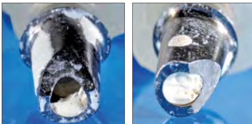
Fig 3 Representative open abutment (left) and internal vent abutment (right) showing the cement flow inside the screw access channel.