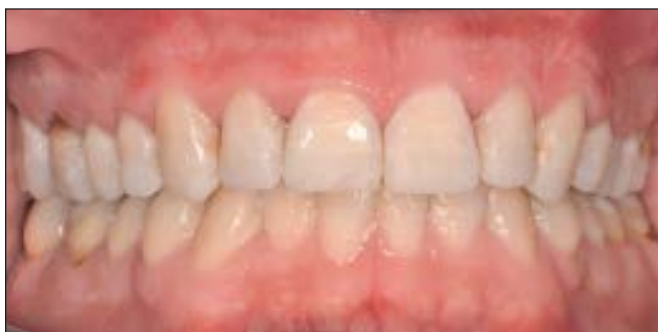
Fig 4 Full-mouth rehabilitation from substantial erosive loss of dental hard tissues and loss of VDO. Adhesively bonded composite resin restorations directly after bonding.

three appointments. The digital setup has to be made only once and can be replicated or easily modified. In contrast to Vailati and Belser, 4 a full-mouth tooth arrangement at an early stage is preferred, since limited space in the molar region could influence treatment planning and clinical decision-making, including the use of orthodontic treatment or gingival correction surgeries to achieve a pleasing esthetic outcome.