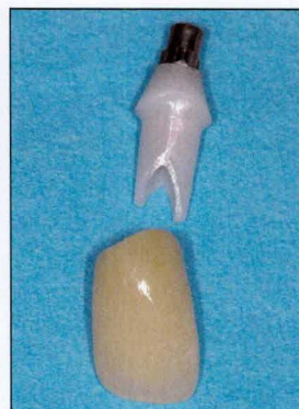
Fig 2 Zirconia abutment with engaging titanium insert and zirconia-based single crown, cement retained.