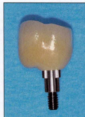
Fig 3 Screw-retained single crown with engaging titanium insert at implant level.