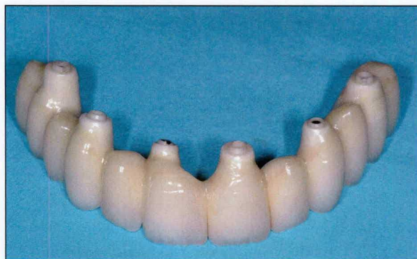
Fig 1 Symmetrically distributed implants in a one-piece 12-unit FDP.