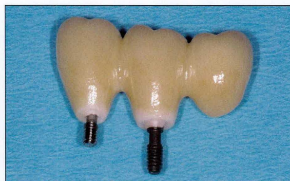
Figs 4a and 4b Three-unit cantilever FDP with screw-retained non-engaging retention, at implant level.

after sinus floor elevations involving a lateral window access. Bio-Oss was used as the graft material and Bio-Gide barrier membranes (Geistlich) were used, where indicated. A diagnostic tooth setup served for planning and fabrication of radiographic and surgical splints for presurgical analysis and predictable implant placement. In complex situations, three-dimensional (3D) planning software was used (NobelGuide, Nobel Biocare). Implants were immediately placed in the extraction sockets, especially in patients of advanced age. Deep crown or root fracture and advanced attachment loss were a few reasons for extraction.