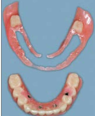
Fig 11 ( right ) Cameo surface views of the AvaDent fixed conversion denture and the separated section.

6. The AvaDent conversion denture was positioned over the temporary copings with the denture base (Fig 9) and occlusion guiding its appropriate position. The denture was connected to the temporary copings by flowing autopolymerizing acrylic resin between the channels in the denture and the temporary copings and allowing the resin to polymerize (Fig 10). The temporary coping screws were then loosened and the prosthesis was removed from the mouth. The struts were sectioned to separate the peripheral section of the denture base from the central portion that would serve as the immediate fixed CD (Fig 11). Autopolymerizing resin was flowed as needed between the denture base and the temporary copings where voids were present to attain a smooth transition between the denture base and copings (Fig 12). The converted mandibular provisional fixed CD was finished, polished, and attached to the implant multi-unit abutments using the temporary coping screws. The occlusion was finalized against the previously fabricated maxillary