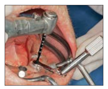
Fig 7 Sequential osteotomy performed for placement of implants using the NobelGuide surgical template.