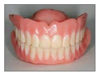
Fig 2 Maxillary and mandibular provisional complete dentures.