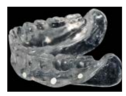
Fig 3 Mandibular radiographic template with fiduciary markers.