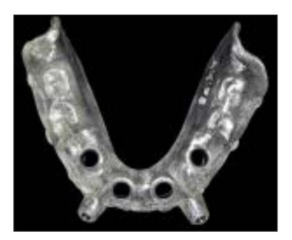
Fig 6 Mandibular NobelGuide surgical template.