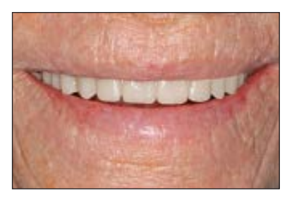
Fig 14 Smile view of the patient with the provisional prostheses.