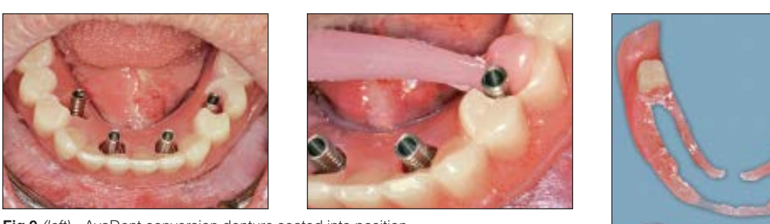
Fig 9 (left) AvaDent conversion denture seated into position.

Fig 10 (center) Autopolymerizing resin being flowed to connect temporary copings to conversion denture.