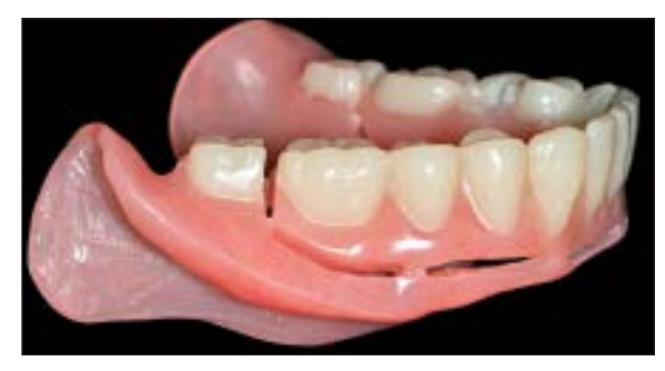
Fig 5 AvaDent milled conversion denture with slots and channels for easy pick-up and separation.

4. The virtually determined implant positions (Fig 4) were finalized using the NobelClinician software, and the required data was sent to Nobel Biocare for fabrication of a NobelGuide surgical template. The virtual implant positions were then used by Global Dental Science to fabricate an AvaDent mandibular conversion CD (Fig 5). This conversion denture had channels milled through the denture base at the appropriate positions where temporary copings would be located after their attachment to the implant abutments. It also had a premilled slot located around the denture base with a small number of struts that connected the peripheral denture base to the central portion of the conversion denture that