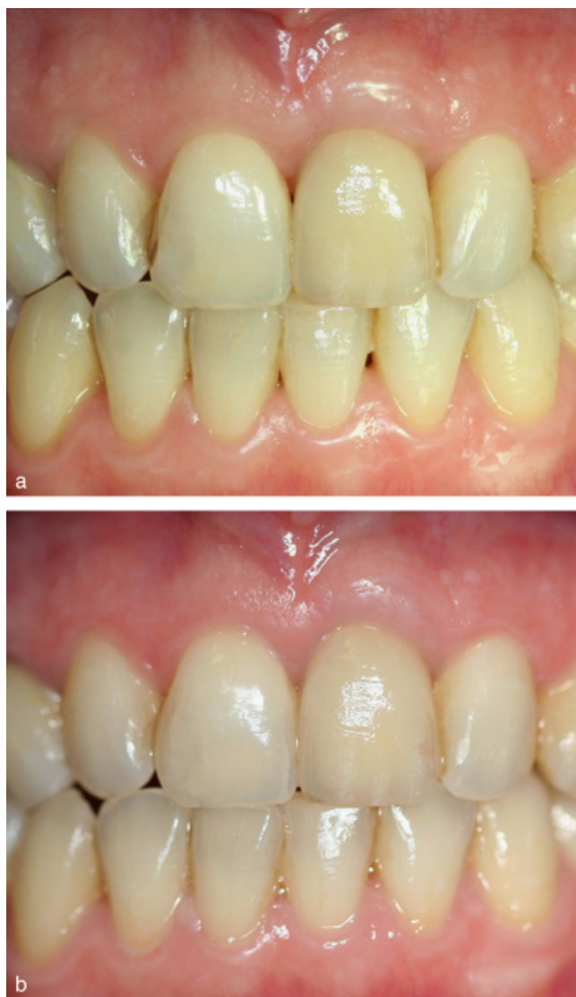
Fig. 1. (a) One-year and (b) 3-year result of a single-implant case.