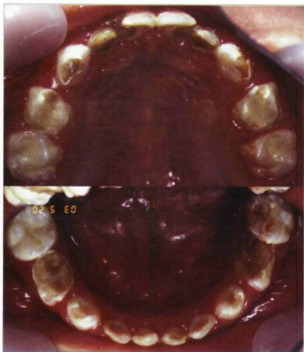
Figure 1. Both arches showing erosions on all 4 first primary molars and moderate to severe dental caries.

per, had to do things that he did not want to do, and scolded by others. Because his pediatrician and parents overlooked the adverse influence of vomiting on his dentition and paid no attention to his oral hygiene, his first visit to a dental clinic was delayed.