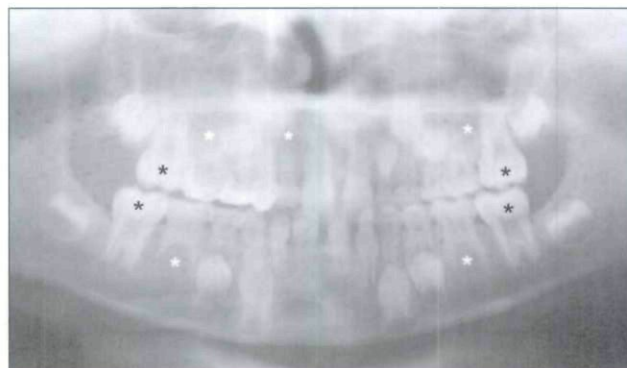
Figure 2. Representative panoramic radiograph of 7-year-old patient at diagnosis who received chemotherapy and 2,100 cGy. Notice hypodontia of mandibular and maxillary second premolars and right lateral incisor (light asterisks) and taurodontia (dark asterisks) of mandibular and maxillary first molars.