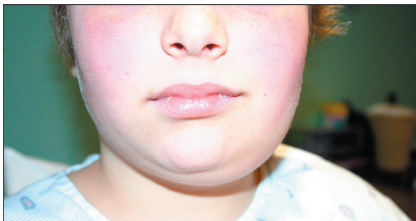
Figure 1. Significant left face and neck swelling.

A 10-year, 7-month-old Caucasian girl with no known health problems presented for an emergency dental exam at the Nationwide Children's Hospital dental clinic complaining of pain and swelling on the left side of the face and neck, which had started approximately 48 hours before. She had a negative history of weight loss, recent illness, bone pain, fever, oral infections, trauma, toothaches and recent dental procedures. The patient was taking no medications and had no known drug allergy. Her weight was 49 kg. She had mild dysphagia, but no breathing difficulties. The extraoral exam showed a large swelling on the left face and neck crossing the midline (Figure 1). The mass was firm and painful upon touch, and the mandible's inferior border was not palpable.