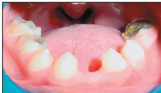
Figure 3. Mandibula: Absence of central and lateral incisors and premolar teeth.