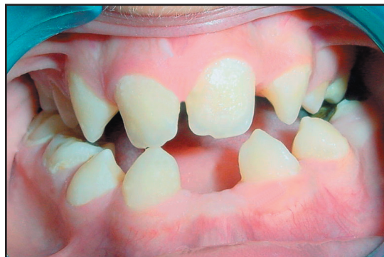
Figure 4. Occlusion: Malocclusion and growth deficiency of the jaws.