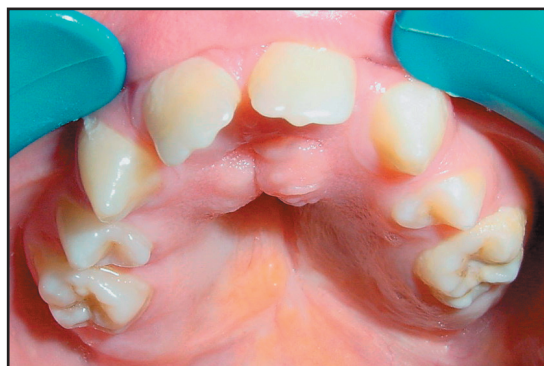
Figure 2. The patient's intraoral appearance revealed the oral and dental abnormalities. Maxilla: Operated cleft palate, absence of lateral incisors, and premolar teeth.