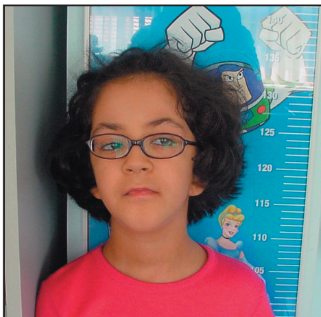
Figure 1. The patient's facial appearance.

Considering the continuing development of the jaws, carious teeth were restored with composites (3M Filtek Z250, 3M ESPE Dental Products, St. Paul, Minn), whereas the tooth with a poor prognosis (mandibular left first molar) was extracted. Orthodontic and prosthodontic treatments could not be planned because of the mental retardation.