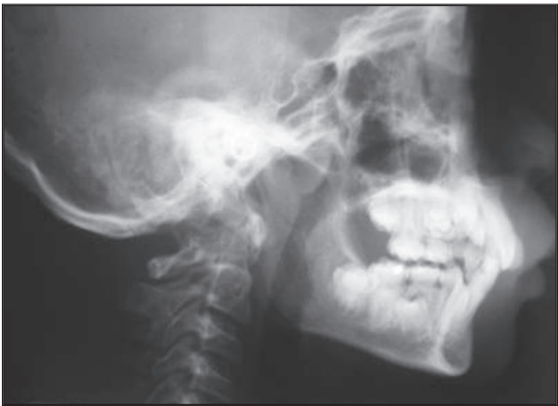
Figure 9. Cephalometric radiographs: maxillary and mandibular prognathism, high positive discrepancy between upper and lower jaws, vertical growth pattern, divergence of occlusal plane in relation to cranial base, lingual inclination and retrusion of upper and lower incisors.