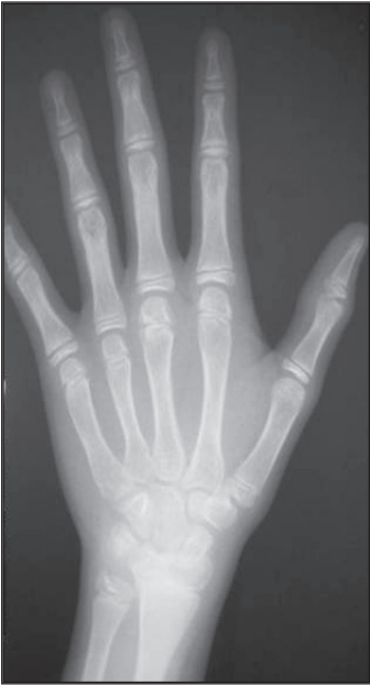
Figure 10. Hand-wrist radiograph: the estimated bone age (11y and 6m), measured with carpal x-ray, was delayed in comparison to his chronological age (13y and 9m), also using the Greulich & Pyle method.

Both patients involved in this evaluation presented with a characteristic phenotype. The differences in the intensity of expressions can be explained by expressivity of the gene. Some findings related in the literature are absent in these cases as skin manifestations “café-au-lait” spots, pigmented nevi, lentigo, and keratosis pilaris atrophicans faciei. 4-6