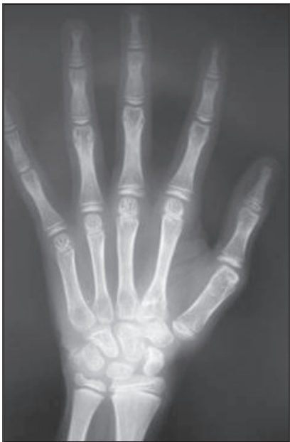
Figure 5. Hand-wrist radiograph: the estimated bone age (13 years old), determined by analysing a carpal x-ray using the Greulich & Pyle method was delayed in comparison to his chronological age (14 years and 9 months).

Oral examination revealed a mixed dentition, Class II malocclusion, mild mandibular retrognathism, dental misalignment, and carious lesion in the lower first molars. The patient also presented with a high level of biofilm along