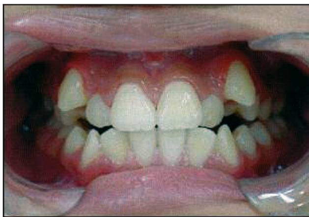
Figure 2. Intraoral aspect: mixed dentition, class II malocclusion, cross bite, and lack of space for the correct dental alignment. The patient also presented with a high level of biofilm along with generalized gingival inflammation.