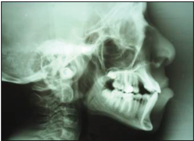
Figure 4. Cephalometric radiographs: maxillary and mandibular retrognathism; positive discrepancy between upper and lower jaws; vertical growth pattern; divergence of occlusal plane in relation to cranial base; buccal inclination and protrusion of upper and lower incisors.