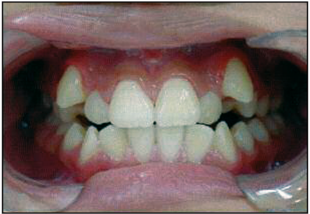
Figure 7. Intraoral aspect: mixed dentition, class II malocclusion, mild mandibular retrognathism, dental misalignment. The patient also presented with a high level of biofilm along with generalized gingival inflammation.