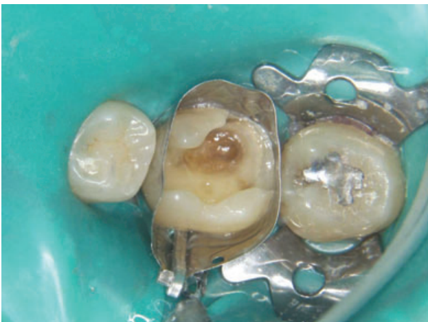
Figure 5. An ethanol-based adhesive system was applied on both the enamel and dentin.

Rubber dam was removed, the occlusion was checked, and the restoration was finished using the Ultradent Composite Finishing Kit (Ultradent Products, Inc.)