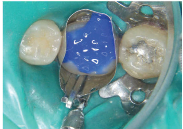
Figure 4. Etching was performed using 35% phosphoric acid.