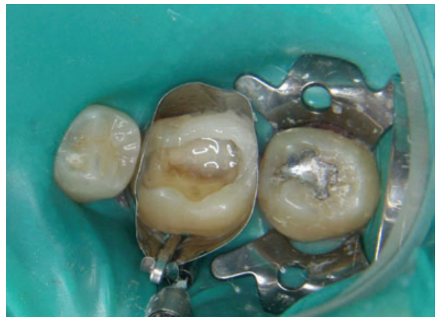
Figure 6. The peripheral enamel skeleton was built up using wedge-shaped increments of Pearl Smoke and Pearl Frost shades; dentin stratification was started placing a 1-mm layer of A2 flowable composite resin.