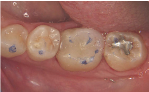
Figure 9. Postoperative occlusal view of the final restorations after occlusion checking.

Statistical analysis was performed using a Chi-square test ( \chi^2 ) and the