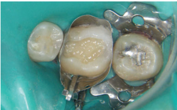
Figure 7. Dentin stratification was completed by using wedge-shaped increments of dentin shades.