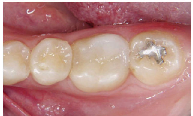
Figure 10. Result at the 30-month recall.