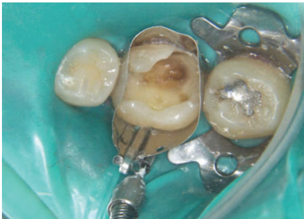
Figure 3. Cavity preparation was completed and a circular matrix was placed.