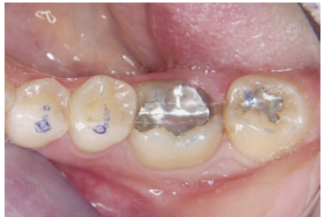
Figure 2. Before starting anesthesia, occlusion was checked and centric stops were recorded.