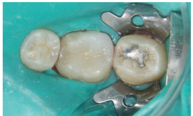
Figure 8. Restoration was completed with the application of Pearl Frost shade to the final contour of the occlusal surface.