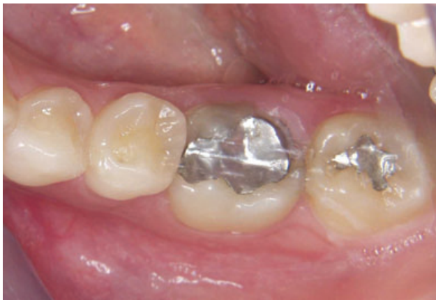
Figure 1. Preoperative view of tooth #30 with fracture of the linguo-distal wall.

Vit-l-escence microhybrid composite resin (Ultradent Products, Inc.) was used to restore the teeth. Stratification with multiple 1- to 1.5-mm triangular-shaped (wedge-shaped), apico-occlusal placed layers of Pearl Amber or Pearl Smoke plus Pearl