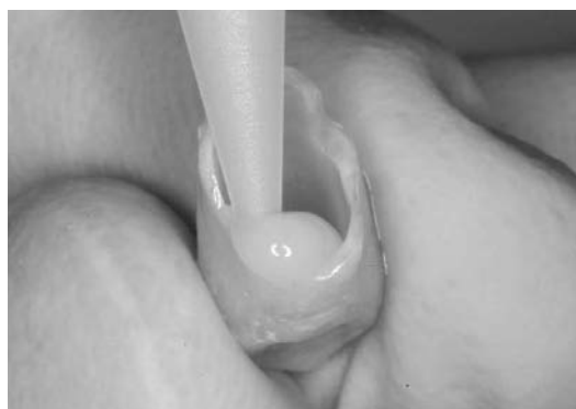
Figure 10. A bis-acryl is applied to the inside of the tooth.