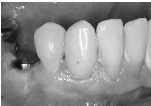
Figure 21. Provisional at 2 months postoperative.