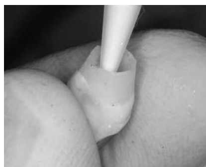
Figure 16. Zone cement is injected into the provisional.