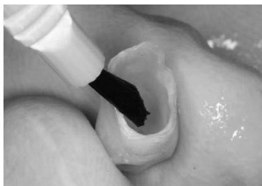
Figure 8. A bonding agent is applied and air dried.