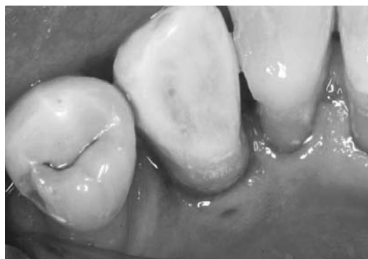
Figure 20. Lingual view on the day of surgery.