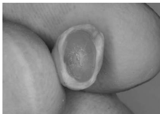
Figure 6. The tooth is hollowed out to fit over the abutment.