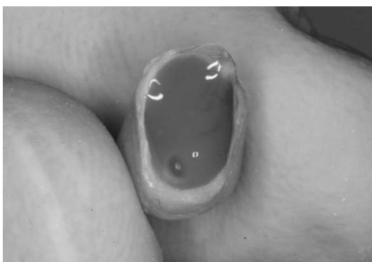
Figure 7. The tooth is etched for 30 seconds.

The patient was advised against using the surgical site and that care should be taken when performing oral hygiene. After 2 months of healing, the patient returned for a tissue check. The free gingival margin had maintained itself without recession (Figures 21 and 22). The 2-month postoperative radiograph