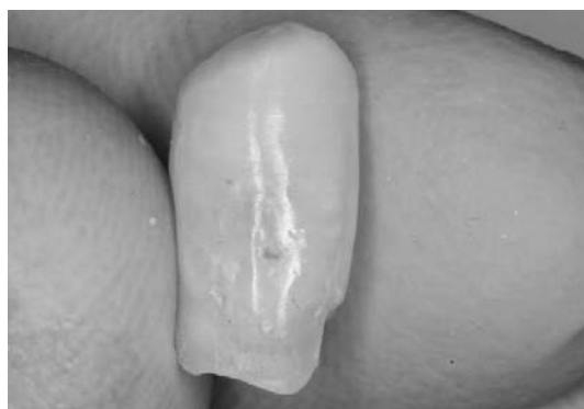
Figure 5. The root is sectioned horizontally 3 mm from the cementoenamel junction.