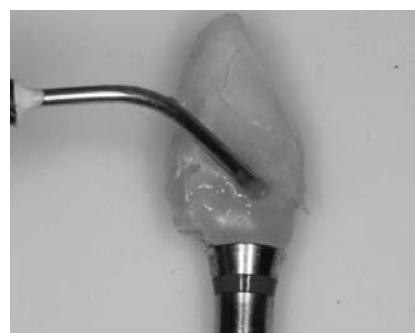
Figure 14. A flowable resin is used to reline the margins.