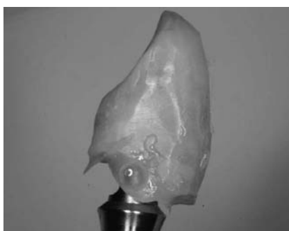
Figure 13. The provisional does not fit the margins accurately.