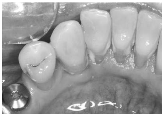
Figure 22. Lingual view at 2 months postoperative.