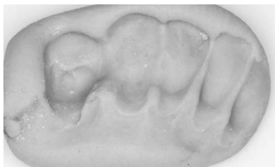
Figure 1. Fabrication of a putty matrix prior to the extraction of the tooth.

A 13 mm Straumann (Straumann, Basel, Switzerland) standard-diameter 4.1 mm implant with a 4.8 mm collar was inserted with the top of the implant placed 3 mm from the final proposed gingival margin. A 16 mm guide is shown in Figure 2. Ideally, the 1 mm polished collar should be above the bone level. With a