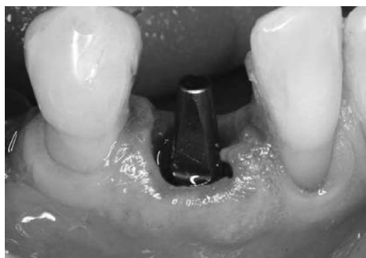
Figure 3. A 7.0 mm solid abutment is hand tightened on the implant.

CT, USA) was injected into the tooth (Figure 10), which was then placed onto the abutment with the use of the putty index (Figure 11). This was allowed to fully polymerize for 2 minutes. It is difficult to get an accurate margin when relining a provisional, so it is necessary to reline the margins out of the mouth with a flowable resin. This resin adheres to the bis-acryl material well. A laboratory implant analog with an actual 7 mm solid abutment was later used to reline