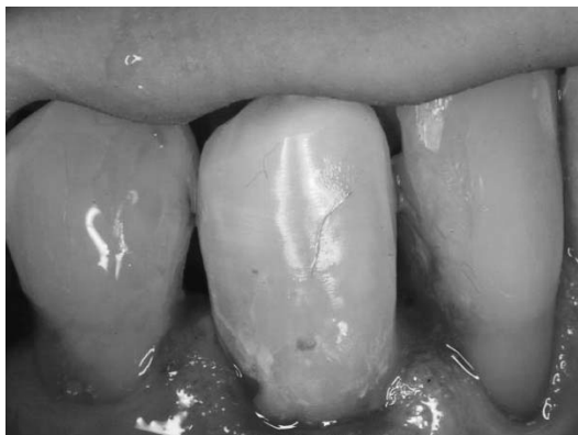
Figure 11. The tooth is placed on the abutment and allowed to cure for 2 minutes.