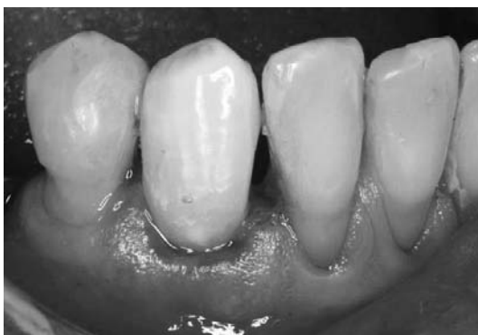
Figure 19. Tooth cemented on the abutment on the day of surgery.