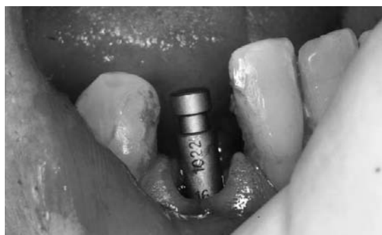
Figure 2. A guide pin is used to measure the depth of the implant.