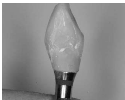
Figure 15. Final reline of provisional margins.