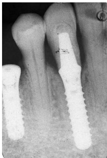
Figure 23. Radiograph at 2 months postoperative.