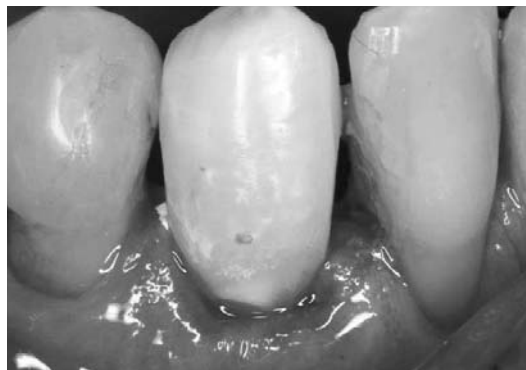
Figure 18. The provisional is placed on the abutment with minimal excess cement.