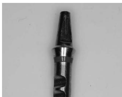
Figure 12. An implant analog with corresponding abutment is used later to reline the provisional because of inaccurate margins.