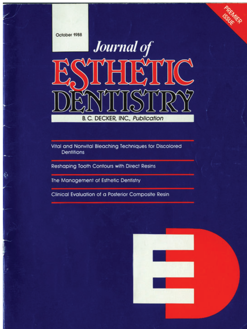
Figure 1. Inaugural issue of the original Journal of Esthetic Dentistry.

In 2007, the Journal also undertook a massive back issue digitization project, which converted print copies of the Journal into electronic editions that are now available on Blackwell Synergy. Personal, member, and certain institutional subscribers now have complete access to every issue of the Journal published since Volume 1, Issue 1. In addition, readers who wish to keep on top of current content can subscribe to a service that sends an e-mail notification with links to articles each time a new issue comes out. For more information about online content and free e-mail table of contents alerts, visit http://www.blackwell-synergy.com/loi/JERD .