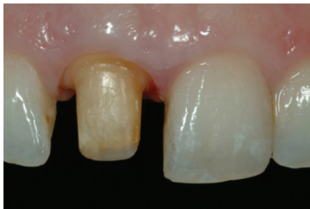
Figure 6. The tooth preparation has been refined with a rounded shoulder finish line. Note the color of the abutment tooth which may affect the definitive outcome based on the material selection.