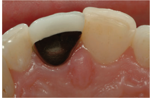
Figure 2. An occlusal view of a failing metal-ceramic crown tooth #8. Note the palatal inclination of the crown.

reproduce the restoration several times until the restorative dentist, the ceramist, and the patient are all satisfied, may be the cause of patients losing trust in the restorative team.