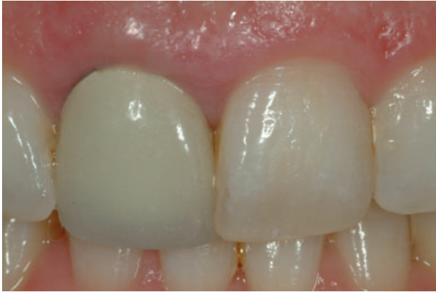
Figure 1. A frontal view of a failing metal-ceramic crown tooth #8. Note the exposed metal at the margins, the mismatch in shade, and the overlap with tooth #9.