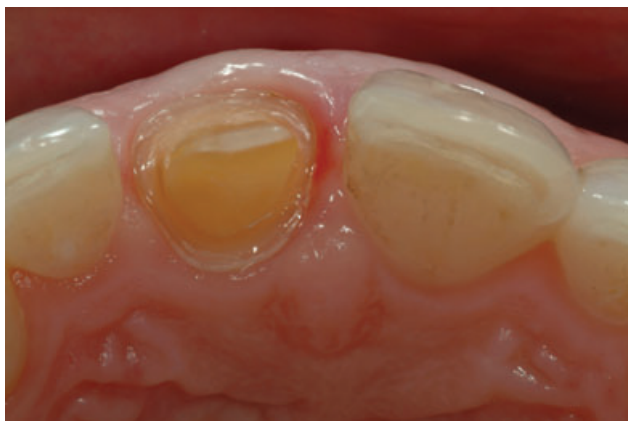
Figure 5. An occlusal view of the definitive preparation creating adequate space for the restorative material while managing the health of gingival tissues.