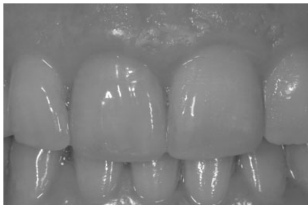
Figure 8. A frontal view of the completed restoration in the patient's mouth 2 years after cementation. Note the value of the restoration as related to the adjacent dentition.