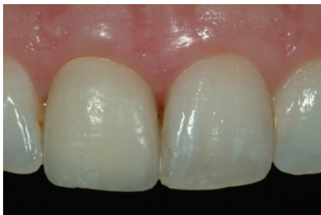
Figure 7. The provisional restoration generated of the diagnostic wax-up is placed to assess contours, surface texture and characterizations, soft-tissue integration, and shade.

characterization and the form of tooth to be matched, so it may serve as a reference for those variables. Digital images of the tooth prior to preparation as well as of the complete abutment are critical particularly if a decision is made to use an all-ceramic crown (Figures 5–7). Some materials are