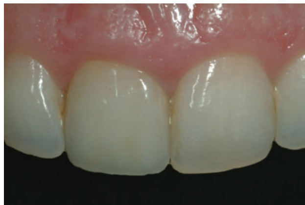
Figure 9. A frontal view of the completed restoration in the patient's mouth 2 years after cementation.

Evaluating cervical contours and the presence of a recession will affect the prospective integration of the restorations with the supporting tissues as well as with the adjacent tooth using the fabrication of a cements/enamel junction and mimicking the root or the use of surgical root coverage. Variations in shape and proportions, crowding, rotations, and diastemata must all be discussed with the patient and taken into account by the dental ceramist while fabricating the restoration. Many times, because of the complexity of the tooth to be matched, the best possible solution is to have the ceramist see the patient and to actively participate in the restoration matching process while also fabricating custom shade tabs as needed.