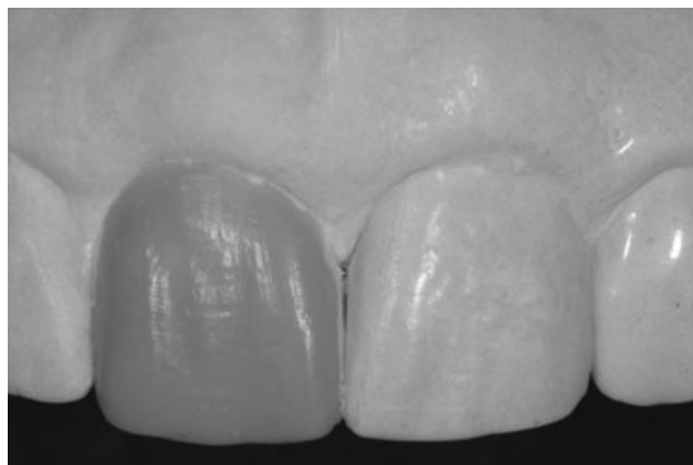
Figure 3. A frontal view of the diagnostic wax-up. Note the reproduction in wax of the surface texture and contours of the adjacent maxillary incisor.