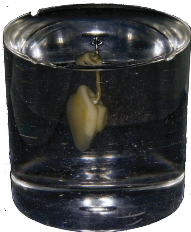
Figure 2. The silicone mould used to fabricate the composite shade specimens.