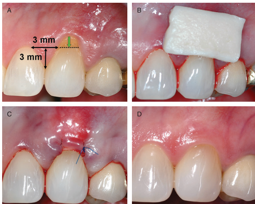
Figure 1. A, Root coverage can be achieved to a level 3 mm apical to the papilla tip providing the papilla is 3 mm wide at that level. B, AlloDerm graft on the surface before insertion into the pouch recipient site. C, AlloDerm graft inserted into pouch and sutured. D, Complete root coverage achieved as seen at 4 years after surgery.

papilla has a width of at least 3 mm at its base. The papilla base is located at a point 3 mm apical to the papilla tip (Figure 1). If the papilla is narrower than 3 mm at its base, it will not support the graft over the root at this level and less root coverage will be achieved.