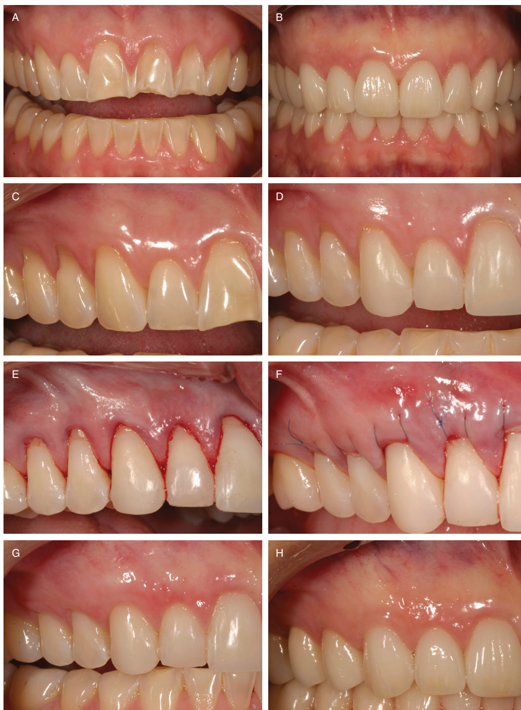
Figure 2. A, Generalized erosion, abrasion, and tooth wear requiring full-coverage restorations complicated by generalized gingival recession. B, Restoration of ideal tooth form with full-coverage restorations made possible by root coverage grafting resulting in enhanced esthetics. C, Maxillary right quadrant prior to treatment. D, Composite bonding restores the areas of lost enamel without extending onto root surfaces. The bonding will serve as provisional restorations during the healing period after soft tissue grafting. E, A tunnel recipient site is prepared facial to the incisors, canine, and premolars and root planing is completed. F, An 8 × 42-mm AlloDerm graft has been secured facial to the incisors, canine, and premolars within the tunnel with a subpapillary continuous sling suture. G, Complete root coverage to the composite margins has been achieved. H, At 6 months after surgery, final full-coverage porcelain restorations have been placed.