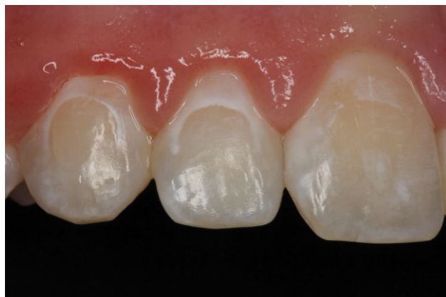
FIGURE 1. Orthodontic white spot lesions (WSL) on enamel surfaces; these were adjacent to labial fixed orthodontic appliances. The white, opaque appearance is due to change in the refractive index of the subsurface enamel.

caused by developmental or acquired conditions other than orthodontic fixed appliances are beyond the scope of this article.