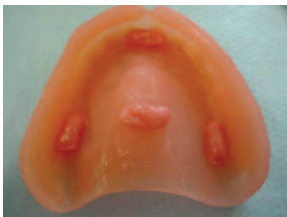
Figure 2. Denture adhesive application.

adhesive (Kukident, Procter & Gamble Co.) was applied to the maxillary denture—4 strips of 1 cm of adhesive were placed at the front, posterior, right, and left border of the posterior palatal seal (Fig 2). The lengths of the denture adhesive strips were measured with a Boley gauge, and the excess was cut off with a sharp instrument. The denture adhesive selected for this study was a paste containing a calcium/zinc PVM/MA copolymer, paraffinum liquidum, cellulose gum, petrolatum, silica, and aroma. BFDD measurements were repeated thrice after the 1st, 2nd, 4th and 6th hours following the application of the denture adhesive. On each occasion, the subjects were allowed to reseat their denture by bringing their mandibular denture teeth into occlusion with maxillary denture teeth between recordings.