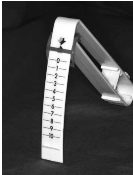
Figure 1. Disposable gnathometer.

Participants were 15 volunteer complete-denture-wearing patients in both the mandible and maxilla (7 female and 8 male) who were treated for new