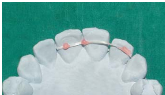
Figure 4. Determination of the required length of ribbon by dental floss.

As the fixed interim restoration was bulky and overcontoured, the patient was clearly informed of the importance of oral hygiene by giving more