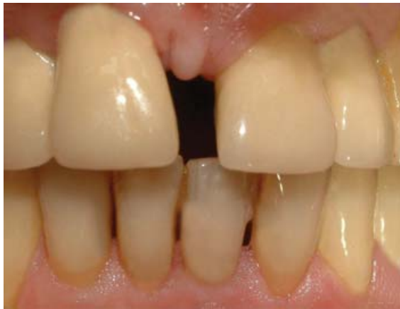
Figure 9. Facial view of the final restoration after 8 months.

(Fig 10). The mandibular left central incisor was determined to have a hopeless prognosis and was planned for extraction. The patient demanded an immediate restoration for the edentulous space. The restoration was accomplished as previously described. Figure 11 shows the clinical condition at the 8-month follow-up appointment.