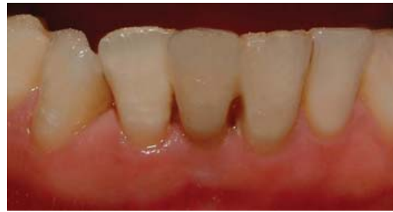
Figure 11. Facial view of Case 3 after 8 months.

patients demand an attractive provisional solution immediately after the extraction of the anterior tooth. 12