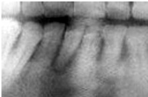
Figure 10. Radiographic view of Case 3.

Dental implants possess many advantages and can be an essential part of prosthodontic treatment planning for missing teeth. In the anterior region of the mouth, implant-assisted restorations may provide optimal esthetics and avoid irreversible preparations of intact adjacent teeth. When implants are placed with a 2-stage surgical protocol in the anterior segments of both jaws, esthetic compromises during healing are of concern. Many