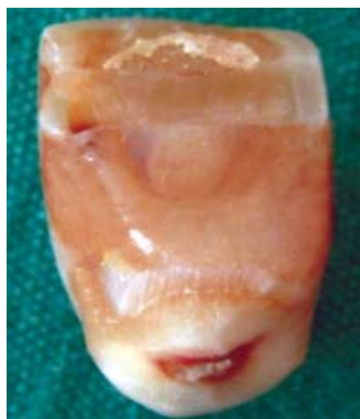
Figure 2. The prepared pontic tooth.

The required length of ribbon (Ribbond, Ribbond Inc., Seattle, WA) was determined by measuring the space with dental floss on the diagnostic cast before extraction (Fig 4). The ribbon was wet with unfilled resin (Filtek Flow, 3M ESPE, St. Paul, MN). Care was taken to keep the wet ribbon from light to prevent initial polymerization, which would interfere with manipulation of the ribbon. The adjacent central and lateral incisors' mid-palatal and proximal sections were prepared according to the manufacturers' directions. Lip retractors and cotton rolls were used to isolate the working area. The palatal and proximal surfaces of the adjacent teeth and the pontic were acid etched with 37% phosphoric acid (Scotchbond Etchant, 3M ESPE) (Fig 5). Bonding agent (Single Bond,