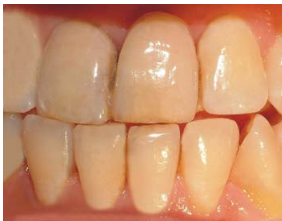
Figure 7. Facial view of the restoration after 15 months.

satisfactory abutments for a fixed partial denture. Also, the patient was in the middle of chemo-radio therapy and could not tolerate either long dental appointments or dental implant surgery. It was decided to extract the tooth, remove the crown from the root, and use it as the interim fixed restoration in a single appointment. The extracted tooth and the adjacent teeth were prepared as in Case 1. The restoration was placed and finished. The patient was called for follow-up appointments at 1 week, 1 month, and 8 months. Figure 9 shows the clinical condition at the 8-month follow-up appointment.