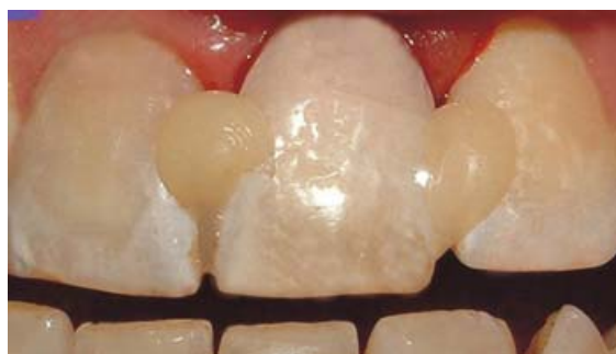
Figure 3. The temporary attachment of the pontic tooth by composite resin.

3M ESPE) was applied and light polymerized with a halogen light of 500 mW/mm 2 (Hilux, Benlioglu, Turkey) for 10 seconds. A thin layer of universal hybrid composite resin (Filtek Z250, 3M ESPE) was placed on the palatal surfaces of the adjacent teeth and extended slightly to the proximal surfaces of each tooth adjacent to the edentulous area.