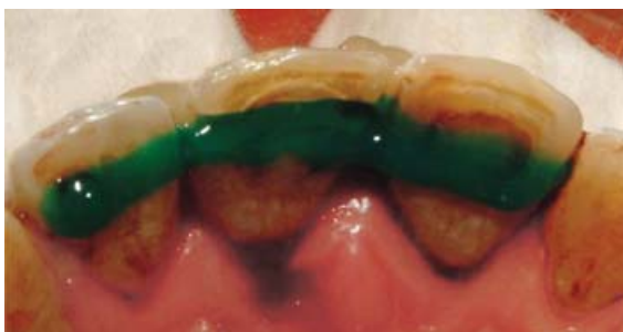
Figure 5. The acid etching of palatal surfaces.

attention to plaque control and traditional home care procedures using proximal brushes and dental floss. The patient was seen for 1-week, 1-month, 6-month, 12-month, and 15-month follow-up appointments.