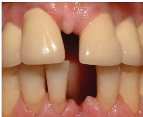
Figure 8. Initial facial view of Case 2.

A 45-year-old woman was referred to the clinic with severe mobility of mandibular incisors