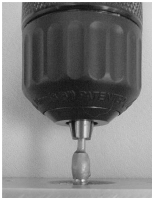
Figure 4 Disk attached to lower member and crown via sprue attached to upper member of Instron for pull-test.