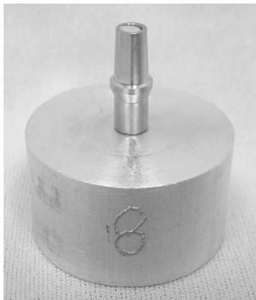
Figure 1 Stainless steel disk containing analog and attached CRC abutment.

The test crowns were fitted to the abutments using a disclosing powder (Quickcheck, Vacalon, Pickerington, OH) under 3× magnification by one of the participants (JS). The internal surface of each crown was airborne-particle abraded with 50- \mu m aluminum oxide (Sterngold, Attetboro, MA), and crown internal and abutment surfaces were steam cleaned (Fig 2).