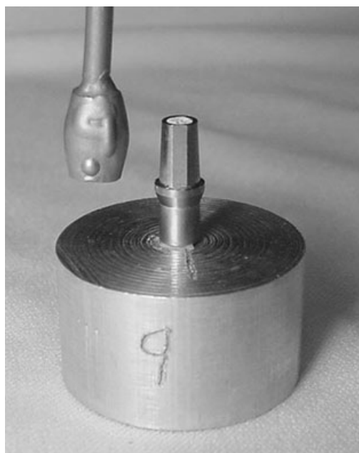
Figure 2 Test crown fabricated to align with CRC abutment.

The cements used in this study are listed in Table 1. All cements were mixed following the manufacturer's instructions. The only alterations to the established manufacturer's protocols were with the second runs of both Im-Prop, in which the petroleum jelly (Perrigo, Allegan, MI) coating of the crown was eliminated, and Premier Implant cement, in which the KY Jelly (Personal Products Company, Skillman, NJ) coating of the abutment was eliminated. This was done to test the retentiveness of these cements in the absence of surface contamination.